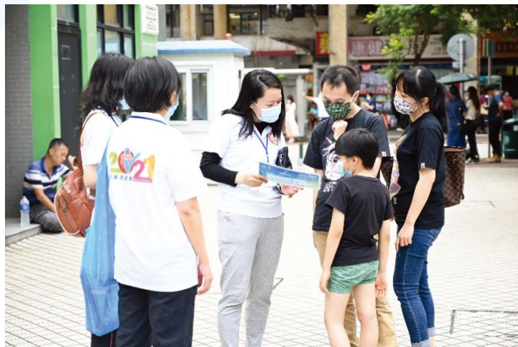
Integrity Volunteer Team assisting in publicity work of the elections