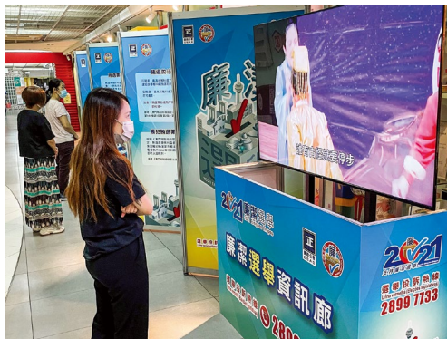
Holding “Zone on Clean Elections” Touring Exhibition to spread clean election messages to the campuses and the community

Between May and September 2021, the CCAC organised nearly 50 sessions of “Zone on Clean Elections” Touring Exhibition comprising the broadcasting of clean election video clips, display panels, colouring competitions for kids and quiz games at the Macao secondary schools, higher education institutions, Convention Center of the Macao Science Center, premises of civic associations, community centres, youth centres and elderly centres in order to directly spread clean election messages to the campuses and the community.