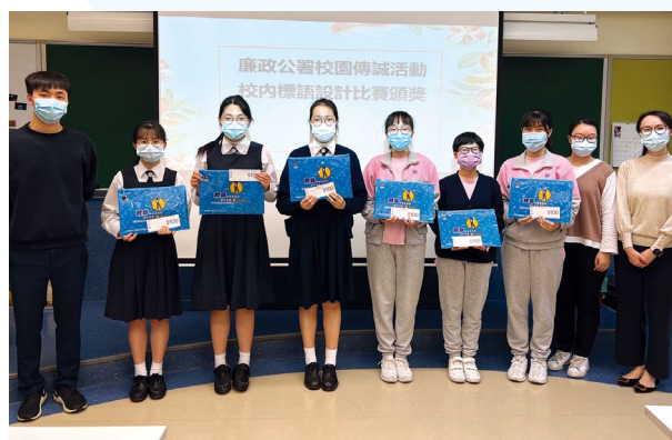
Schools which launched “Integrity Week” activities with new approaches presenting prizes to students who were awarded

In 2021/2022 academic year, the CCAC altered the former way of cooperation with the schools in holding the “Integrity Week” with a view to continuously provide internship opportunities to teenage ambassadors, who would then be the ones to create appropriate integrity activities in order to persistently disseminate clean election messages in the campuses. In November 2021, ambassadors of honesty and integrity of Santa Rosa de Lima (Chinese Section) took the lead to hold the “Integrity slogan design competition” and “Online quiz games” in the campus, giving full play to achieve a good impact of disseminating integrity messages among peers.