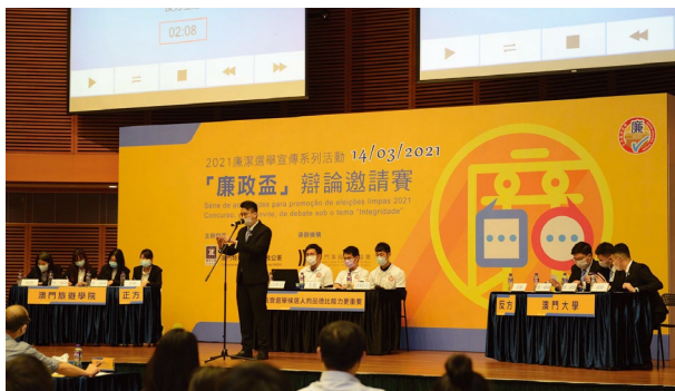
Inviting higher education students to participate in the debate competition to analyse the meaning and values of elections rationally

The CCAC held the "Integrity Cup" Invitational Debate Competition in March 2021. The activity served as a platform for teenage students to have an in-depth discussion on elections, analyse the meaning and values of elections rationally as well as safeguard clean elections jointly.