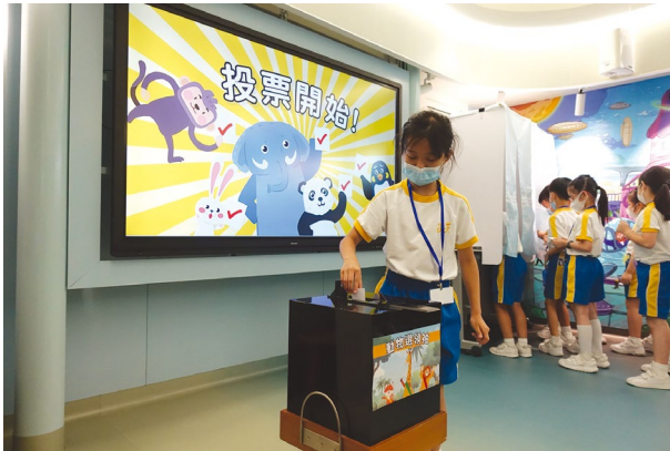
Arranging special events for school children to realise the importance of fair elections during the period of Children's Day

To tie in with the Legislative Assembly Elections which took place in the year, the CCAC held the "Spend the Children's Day with William 2021 – a special event featuring animals voting for a leader" in June and July. The activity, targeting at Primary one and two students, encourages the lower primary students to learn the importance of fair elections through playing games, listening to stories and carrying out mock polls. A total of 28 sessions were held for 880 students from 11 schools.