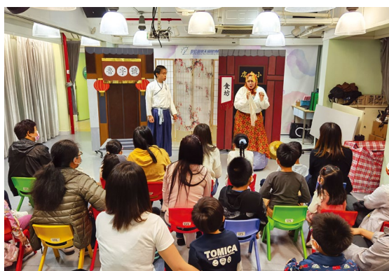
Collaborating with civic associations to deepen integrity education work to the community

To strengthen cooperation with civic associations and make more gainful use of the community network of the civic associations, between November and December, the CCAC held the parent-child activity entitled "Building of Integrity in the Community 2021" interactive education theatre in collaboration with five community organisations, namely Sheng Kung Hui Gambling Counseling and Family Wellness Centre, Fountain of Love and Joy Integrated Family Service Centre – Caritas Macau, the Social Service Division of the Methodist Church Macau – Family Support Education Centre, Stage – Service Center of the Macao Federation of Trade Unions and the Lao Hon Community Centre of the General Union of Neighbours' Association of Macao. By way of "integrating drama into community", the parents and children were able to take a simple test of "integrity" with the characters of the drama through appreciation of drama, body movement games, interactive discussion and craft workshop. As such, they could understand that a person with integrity should behave at his root and upholding integrity served as the key to laying a solid foundation of trust and positive growth. The civic associations were pleased with the way of collaboration to organise activities and suggested the CCAC hold similar types of activities again in the future in order to impress upon the community with integrity education.