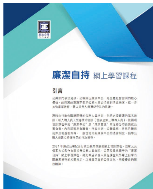
Launching an e-learning course entitled “Uphold Your Integrity” in collaboration with the Public Administration and Civil Service Bureau

The CCAC launched the “Webpage on information about integrity for public servants” in November 2020 to introduce the in-depth concepts of duty-related crimes in a simple way. In 2021, the CCAC updated the information of the columns in the theme-based webpage in order to introduce to the public servants about the principle of exclusiveness as stated in the legal regime of public services and other duty-related crimes. In addition, to tie in with the trend of e-learning in the society, the CCAC launched an e-learning course entitled “Uphold Your Integrity” in collaboration with the Public Administration and Civil Service Bureau. The course, which is offered in modules, introduces to the public servants about the obligations and code of conduct they should comply with in order to enhance their senses of integrity and law-abidingness through self-learning online. Between September and December 2021, the CCAC offered two classes of e-learning course entitled “Uphold Your Integrity” which received favourable responses and attracted 208 public servants to enrol in the course.