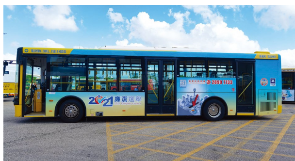
Advertisements on bus bodies