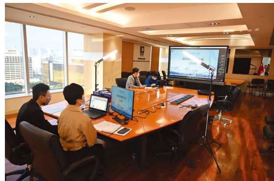
Representatives of the CCAC holding an online meeting with members of "Panel of Advisors for Teaching Materials on Integrity"

To strengthen and expand integrity education targeting at different stages of education, including secondary and primary schools as well as early childhood, the CCAC invited non-tertiary education schools and serving teachers who have participated in the "Integrity Lesson Plan Design Collection Activity" to form the "Panel of Advisors for Teaching Materials on Integrity of the CCAC of Macao". The panel has already put into operation.