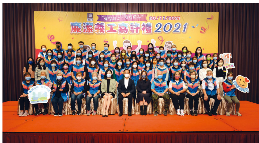
“You are a part of our journey to integrity” - Awards Ceremony for Integrity Volunteers 2021

In order to thank the members of the “Integrity Volunteer Team” for their long-term support to the integrity building of Macao, the CCAC specially held the “You are a part of our journey to integrity” - Awards Ceremony for Integrity Volunteers 2021 in November for expressing its gratitude to outstanding volunteers who proactively assisted the CCAC in various publicity campaigns over the past two years.