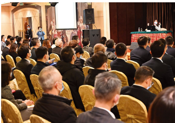
Persistently organising different types of seminars and talks