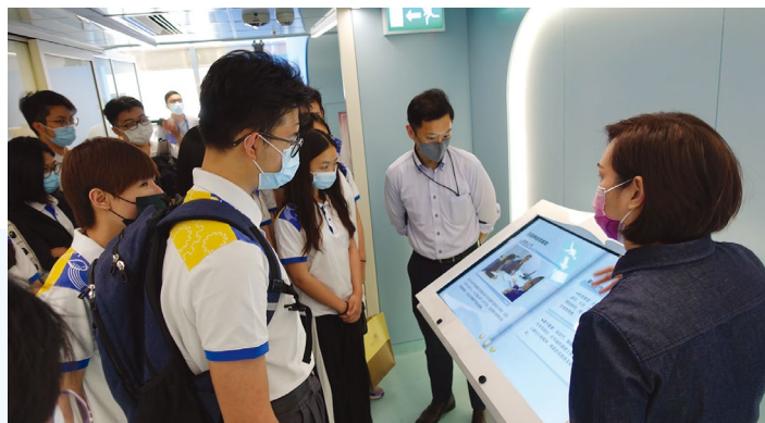
Receiving visitors from institutions and associations for visits assisted in deepening the society’s understanding of the work of the CCAC

In 2021, the CCAC received a total of six institutions and associations which visited the Branch Office in Areia Preta, including the Macao Polytechnic Institute (the current Macao Polytechnic University), the Moon Chun Memorial College of the University of Macau, the “Power for Law Promotion” Teenage Volunteer Team of the Legal Affairs Bureau, the University of Macau’s Subsidiary Association of Macau Asian Law Students’ Association – Macao Sector, Hou Kong Middle School as well as family members of civil servants organised by the Division of Social Support to Civil Service of the Public Administration and Civil Service Bureau. Through attending the seminars and visiting the teaching facilities of the Branch Office, the visitors had a deeper understanding of the CCAC.