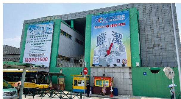
Advertisements at the external walls of public departments