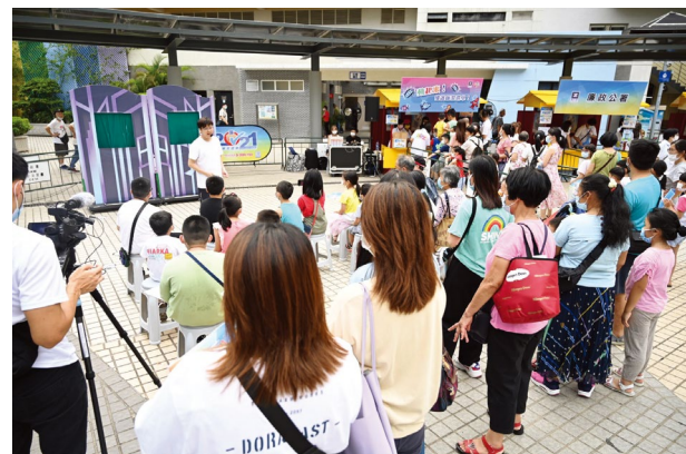
Holding "Clean Election Roadshow 2021" to raise public awareness of clean elections

In order to spread clean election messages to the community and enhance the impact of promotion, the CCAC held the "Clean Election Roadshow 2021" in July in Iao Hon Market Park (the activities originally held in the Flower City Park and the Leisure area of Edif. Wang Hoi and Wang Kin of Fai Chi Kei were cancelled due to the pandemic) to raise public awareness of clean elections.