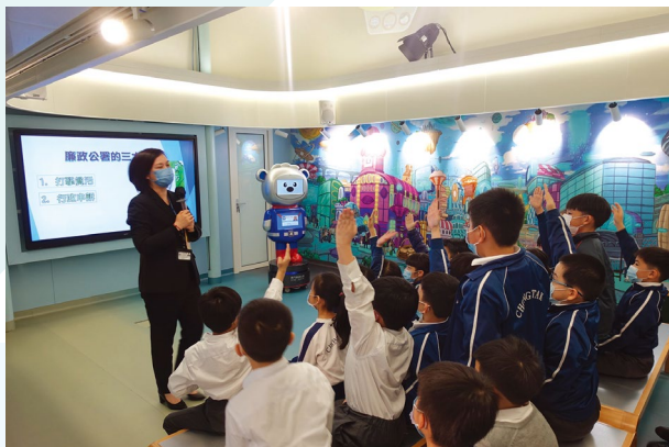
"New Generation of Integrity" has been a brand activity for integrity education

students and visitors are encouraged to learn through playing games by identifying corrupted acts and learning the consequences of corruption during the process. Moreover, to tie in with the CCAC to develop an AI robot to assist in the promotion of the integrity education programme, the cartoon character of the CCAC, "William, the AI robot", which was developed in 2020, has been put into service since 2021. It acts as an assistant instructor for integrity education for primary schools and has classroom interaction with primary students. Being warmly welcome by the students, it helps to enhance the impact of integrity education.