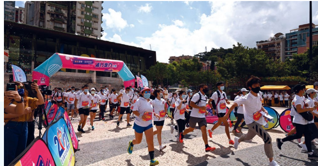
Holding city orienteering competition to promote all citizens to support clean elections

For the first time, the CCAC held the City Orienteering Competition on 16 th May 2021, with a view to promote participants' active participation in the activity to disseminate clean election messages around the city. More than 100 teams enrolled in the competition. The CCAC selected 30 teams by lucky draw. On the competition day, over 100 participants who were divided into groups of three to four people had to complete the mission related to clean elections by setting off at Tap Seac Square and visiting different points within limited time. The activity received favourable responses and the participants agreed that the activity helped them better understand the knowledge of the electoral law which aroused more citizens to pay attention to and support clean elections.