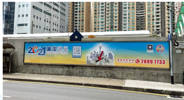
An enterprise lending out its external walls where clean election advertisements were placed