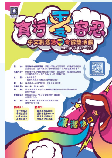
Rolling out creative publicity activities to be in line with the "United Nation's International Anti-Corruption Day"

In line with the "United Nation's International Anti-Corruption Day" on 9 th December, between 15 th November and 31 st December, the CCAC offered an array of publicity activities based on this year's theme of the organisation, "Your right, your role: Say no to corruption". The activities included producing a new series of "United Nation's International Anti-Corruption Day" video clips, rolling out a thematic webpage, holding the collection activity of creative tongue twisters, creating thematic infographics, and showing advertisements or video clips on radio channels, mobile applications, buses and public screens of public departments. The CCAC seeks to remind the general public of Macao, regardless of gender, age and walks of life, that every one of them can actively play a role in graft fight. With zero-tolerance to corruption, they should be brave enough to report and say no to it.