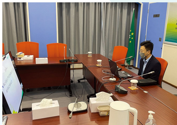
Holding online seminars for the staff members of the institutions at their invitation during the pandemic