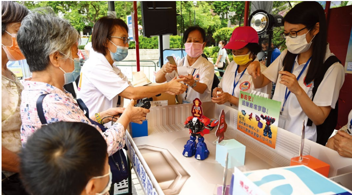
Integrity Volunteer Team assisting in different publicity and education work

In 2020, the CCAC accomplished the recruitment of the members of the “Integrity Volunteer Team” and the “Integrity Volunteer Team – Parent-Child Volunteer Group”. In 2021, the volunteers continued to proactively assist in different publicity and education work. Over 200 volunteers participated in the 22 activities arranged by the CCAC, including trainings, visits and promotion work. As the Legislative Assembly Elections took place in