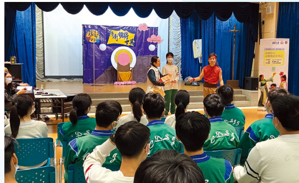
Disseminating clean election messages to students through drama tour activities

The CCAC hopes to, by way of visualising abstract ideas, disseminate clean election messages to secondary students and university freshmen through drama. At the end of the drama performance, the CCAC staff would draw a conclusion from it and point out the commonly encountered problems and myths of elections so as to remind the students to avoid breaching the law advertently due to temptation by advantages as well as understand the importance of clean election to them and the society.