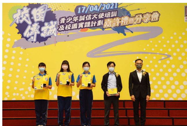
Holding Awards Ceremony where outstanding ambassadors of integrity were awarded

Between January and March 2021, the 87 teenage ambassadors carried out activities to promote integrity and honesty in schools. Apart from display panels, booth games, design of slogans and posters, there were dramas, orienteering activities, comics, microfilms and creative character design etc. The number of persons from different schools participating in the activity ranged from over 100 to 3,000. Based on the activity reports submitted by the teams as well as the scale, creativity and use of resources of the integrity activities carried out by them, the CCAC selected ten outstanding teams.