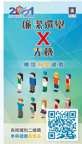
Rolling out WeChat quiz games on the topics related to clean elections

In May and August 2021, the games of “Clean election X-ray machine” and “Learn about clean elections step by step” were rolled out successively and respectively to hammer home clean election messages to the general public through online quizzes. In addition, one day prior to the polling day of the Legislative Assembly Elections, another clean election quiz game, “Learn through watching video clips”, was launched, which featured simple and easily understood animated video clips to further promote the importance of clean elections to the general public. The three games received favourable responses from the general public, recording a total of 53,000 participants.