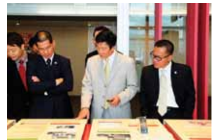
The Commissioner visited the facilities of the ICAC headquarters

The ICAC Commissioner stated that the new leadership of the CCAC, who came from powerful legal background, was technically stronger. Therefore, he believed that their capability would benefit the anti-corruption works and hoped that the two graft-fighters would continue their close partnership.