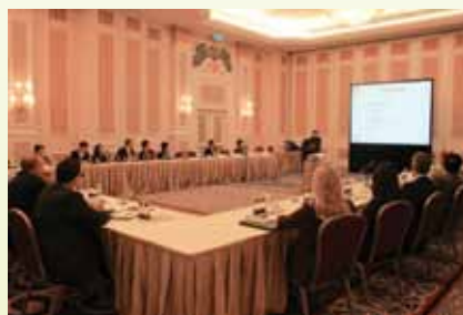
The Venetian Macao Limited