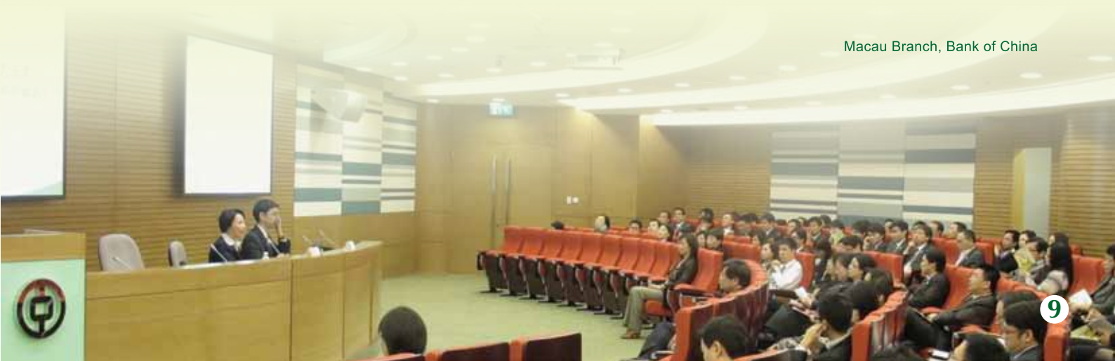
Macao Branch, Bank of China