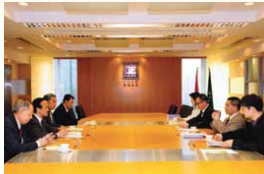
Property Management Business Association of Macao visited the CCAC to gain more knowledge about the law "Prevention and Suppression of Bribery in the Private Sector"