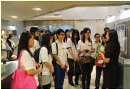
The students visiting the Branch Office at Areia Preta, where they were introduced the integrity education for teenagers in Macao

Apart from the CCAC’s headquarters, the group also visited the Branch Office at Areia Preta, where they were introduced the integrity education conducted by the CCAC among teenagers. After that, they attended the awards presentation ceremony of the “Anti-Corruption TV Commercial Competition for Youth from Guangdong, Hong Kong and Macao” in Hong Kong.