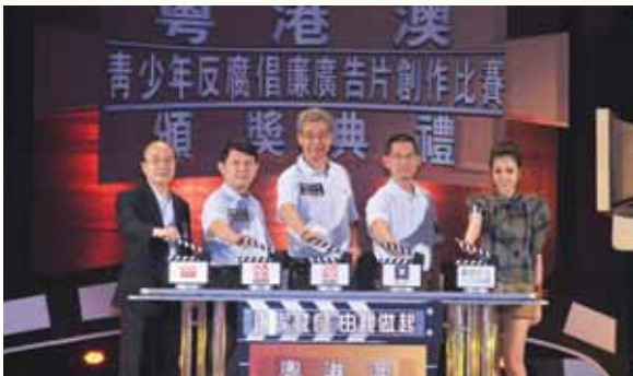
Guests officiating the launching ceremony

In his speech, the Commissioner said that the success of this competition was a good example of the close cooperation of the three places. He noted that social development and promotion of integrity needed innovation by the new generation, therefore, the youngsters’ participation demonstrated the fulfilment of their historical mission. He hoped that the youngsters would continue to promote the culture of probity. Moreover, the Commissioner stressed that the end of the competition symbols the beginning of another integrity promotion plan, since promotion of integrity was an all-time objective and the general public’s participation is the key to success.