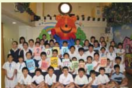
Primary students celebrated Children's Day with William, the Integrity Bear at the Branch Office at Areia Preta