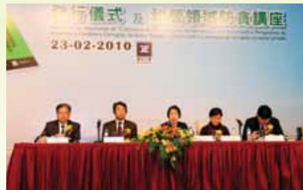
Representatives from Mainland China, Macao and Hong Kong sharing experiences in promoting integrity management and business ethics in the private sector during the Seminar on Corruption Prevention in the Private Sector

join hands with the guilds, the media, the citizens and the society to construct its corruption-prevention network. He also said that the government would co-operate with the CCAC to promote integrity management among local enterprises and establish a clean and fair business environment.