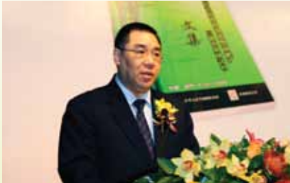
The Chief Executive, Dr. Chui Sai On, delivering a speech

The CCAC held the Launching Ceremony of Collected Essays of Conference “Prevention and Suppression of Corruption in the Private Sector: Reality and Foresight” on 23 rd February at Macau Tower Convention & Entertainment Centre. The Chief Executive, Dr. Chui Sai On, officiated the ceremony and delivered a speech, expressing the Macao SAR Government’s concern for corruption prevention. At the same time, the CCAC also held the Seminar on Corruption Prevention in the Private Sector for exchange of experiences in promoting integrity management and business ethics in the private sector.