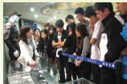
Students from the University of Saint Joseph visiting the Branch Office at Areia Preta