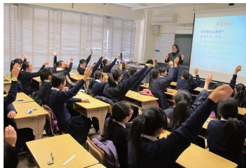
Conveying the message of integrity to secondary students

The CCAC joins hands with Macao's education community and teenage associations to promote integrity and honesty culture and to instill positive value in teenaged students by various means. In 2013, the CCAC has organised a wide range of integrity education activities for secondary and primary students of Macao, with a total of 204 sessions and 10,874 counts of student participants.