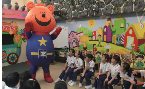
Teaching primary students the importance of honesty and law-abidingness through stories

The “New Generation of Integrity – Education Programme on Honesty for Primary Students”, targeting at Primary three to Primary six students, was conducted in the Branch Office in Areia Preta. Through story-telling, the value of honesty and law-abidingness was brought to the primary students. In 2013, there were a total of 22 primary schools participated in the programme and a total of 92 sessions was held, with 2,853 students. Besides, during the period of Children’s Day on 1 st June, the CCAC organised the special activity for three schools. Eight sessions were held, with 247 students participating.