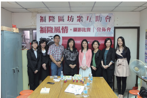
Visiting organisations to collect their comments on integrity work

The CCAC approached the community to promote the message of integrity so as to enlist the community's support and participation in building a clean society. The CCAC also collected public opinions and suggestions so that strategies could be timely adjusted to respond to the requests of the community on integrity building. In 2013, the CCAC carried out exchanges with 14 civil associations to actively promote the message of integrity.