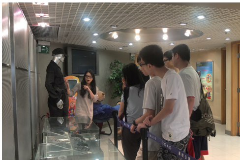
Introducing Macao integrity work to visiting organisations of Branch Office of Areia Preta