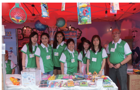
“Integrity Volunteer Team” actively assisting in integrity building