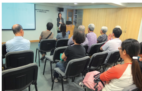
Organising training seminars for new volunteers

During the Legislative Assembly Election 2013, the Integrity Volunteer Team effectively assisted in the promotional work of clean election by distributing and sticking posters and providing volunteer work in many activities such as the large-scale outdoor activity “Join Together for a Clean Election”. They also assisted the CCAC to disseminate the message of upholding probity of election to the community and the general public.