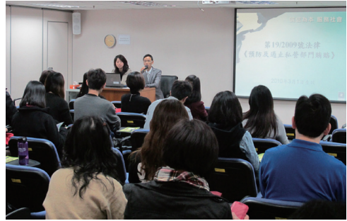
The CCAC continued to hold seminars on Corruption Prevention in Private Sector

The CCAC has organised seminars on the law Prevention and Suppression of Bribery in the Private Sector for civil associations and private entities, at which relevant provisions of the law, aspects to concern for the sector, penalties arised from offending the law, enquiry and report channels were explained. The CCAC strengthened the participants' understanding in relevant law through interaction and exchanges in