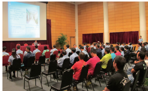
Seminars on public procurement organised for civil servants

For the purpose of strengthening the integrity awareness of public servants, a total of 86 seminars were organised with 5,239 participants, covering a variety of themes including professional ethics and code of conduct, public procurement, declaration of assets and interests etc. It also included the seminar for deepening integrity education for public servants who got promoted in order to build a clean team of public servants.