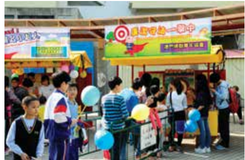
Large numbers of residents participating at the event