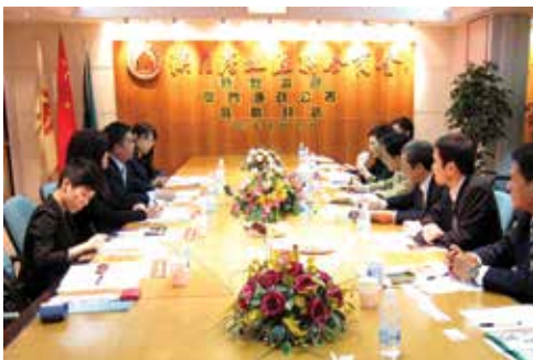
Visiting various industries and civil associations to broadly collect opinions

In order to facilitate more citizens to know about the law Prevention and Suppression of Bribery in the Private Sector , the CCAC has teamed up with a number of associations in Macao to organize a touring exhibition to promote the new law and featured with quiz sessions to enhance the interaction with citizens.