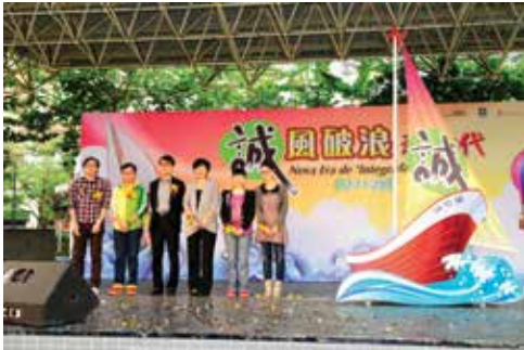
Guests officiating at the opening ceremony

In order to promote integrity and honesty among teenagers, the CCAC held an outdoor event entitled New Generation Strides ahead on the Path of “Honesty” – Probity Education Variety Show for Teenagers, with the collaboration of the Youth Affairs Committee of Macau General Neighbourhood Unions Association, the Youth Committee of Macao Federation of Trade Unions, the Fu Lun Youth Association of Macau, the Macao New Chinese Youth Association and the General Association of Chinese Students Macau. Through infusing education in recreation activities, the CCAC hopes to draw more public attention on the importance of integrity education for teenagers, build the probity culture, so that the youngsters can realize the true meaning of life and live an abundant and meaningful life. The event had attracted a large number of audience who participated actively in the activities. The citizens identified with the importance of further promoting the integrity education for teenagers.