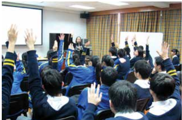
CCAC's staff member discussing value on money with secondary students

In order to further promote integrity awareness among secondary students and foster teenagers’ honesty and righteousness, the CCAC has co-organized the “Integrity Week” with three secondary schools. The activities of the “Integrity Week” included themed seminars on honesty and integrity, special exhibition with display boards inside the schools to introduce the duties and functions of the CCAC, as well as creative activities such as artworks, writing, slogans, display boards and drama creation competition and performances. With the participation of students, the CCAC aims to arouse their attention of the building of personal integrity as well as awareness of the importance of constructing a clean society.