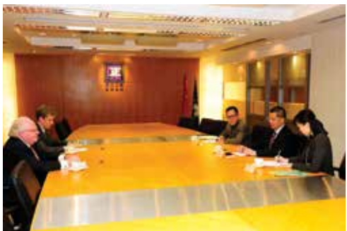
The Australian Consul-General in Hong Kong and Macao, Les Luck, visiting the CCAC