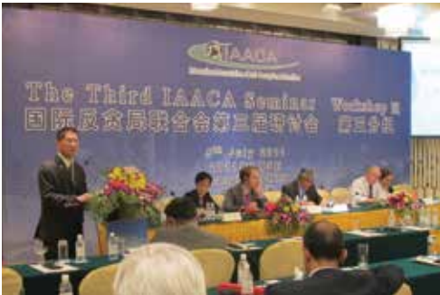
The Commissioner, Fong Man Chong, delivering a speech during the seminar to introduce the system of mutual judicial assistance in Macao