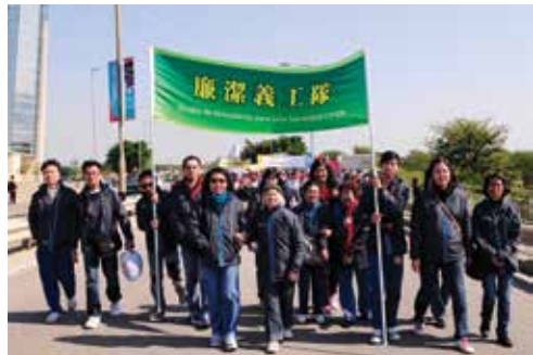
Participating the 28 th Charity Walk for a Million

well as public charity activities. The CCAC hopes to extensively spread the message of integrity to every corner of society through their zealously.