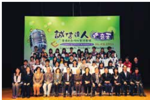
Award winners and guests

In early 2011, the CCAC co-organized the award ceremony for the Radio Broadcasting Drama Contest with the General Association of Chinese Students of Macau. The contest took place in late 2010 with the objective to enable the participants to understand the importance of integrity and honesty to society in the process of creating and producing the radio drama, so as to entrench the value of honesty and law observance among the teenagers. The contest received favourable response from the education sector, a total of 60 teams from 20 schools participated. The entries were of high standard and with great creativity, among which 16 entries were awarded prizes.