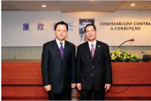
Vice Minister of Supervision of China, Wang Wei, and the Commissioner Against Corruption, Fong Man Chong