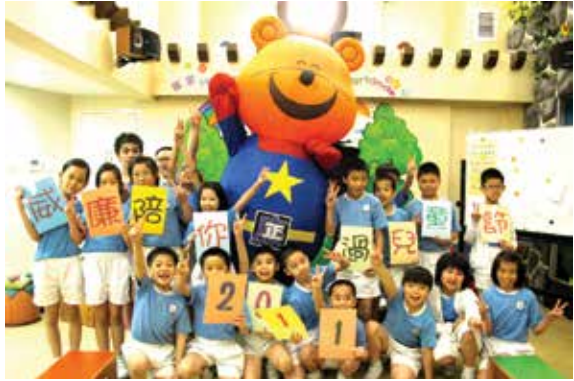
To instill the awareness of honesty and law-abidingness to primary school students through interactive activities at the “Paradise of Integrity”

of primary integrity education set up in the Branch Office in Areia Preta. Integrity education for primary students was conducted through means of puppet shows, computer animation or videos so as to inculcate values such as honesty, integrity, law-abidingness and fairness, as well as to cultivate the ability to discern between right and wrong among the youngsters. There were a total of 26 primary schools participating in this programme, with 4,110 participants.