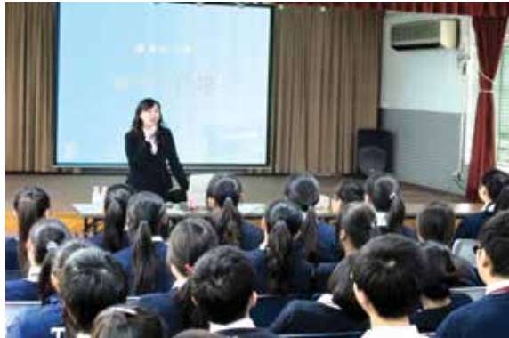
Representative of the CCAC explaining practical integrity guidelines during “A Talk on Integrity for Secondary School Graduates”

As for the secondary school graduates, no matter they choose to further their studies or take up an occupation, they will encounter challenges concerning their personal integrity and protection of their own rights and interests. In view of this, the CCAC has organized seminar entitled “A Talk on Integrity for Secondary School Graduates”. It enabled students to clearly understand the current anti-corruption law, including the legal regimes of preventing corruption