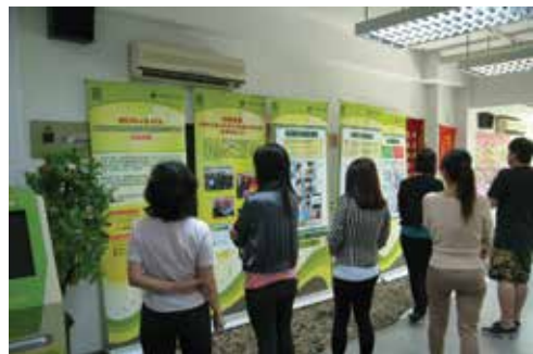
Touring exhibition to promote the new law