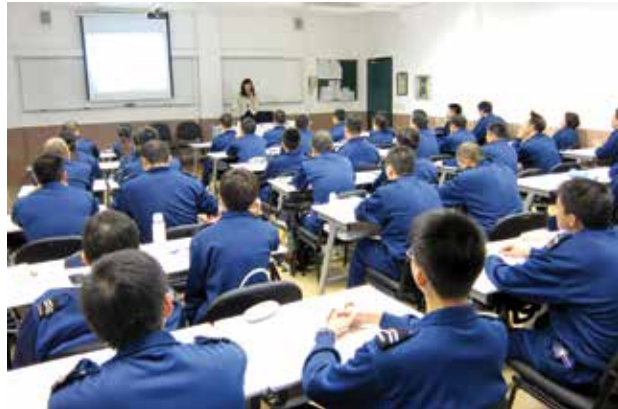
Seminar on "Integrity and Observance" for public servants

The CCAC has always attached much importance to the enhancement of public servants' integrity and ethics. In 2011, the CCAC has organized various themed seminars for the public departments, including seminars on "Integrity and Observance" for new recruits to explain the basic code of conduct and professional ethics for public servants,