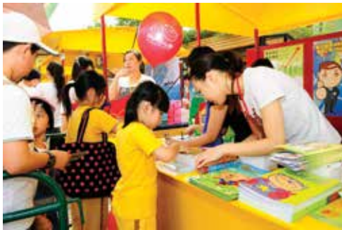
Members of the Integrity Volunteering Team assisting the booth games

The volunteers have assisted various promotional activities of the CCAC as