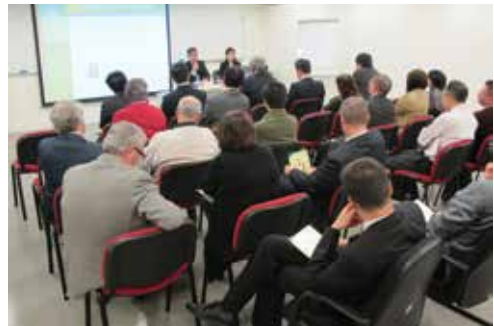
Seminars to promote the new law