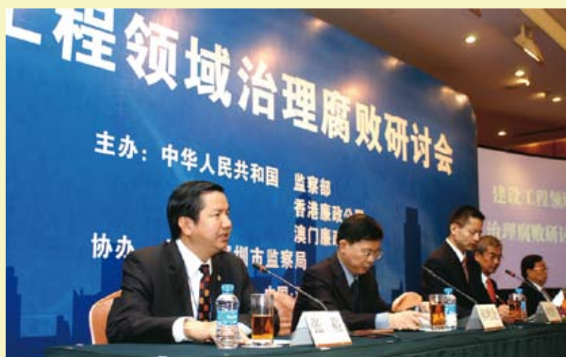
The Commissioner, Cheong U, addressed the opening ceremony of the conference "Corruption Prevention Strategies in relation to Construction Projects"

In January and December 2008, the Ministry of Supervision of the People's Republic of China, the ICAC of Hong Kong and the CCAC co-organized conferences respectively in Shenzhen and Hong Kong, namely "Corruption Prevention Strategies in relation to Construction Projects" and "Conference on Corporate Governance in the Financial Sector." The participants included members of the supervisory agencies of Mainland China, Hong Kong and Macao and senior management staff and professionals in related fields.