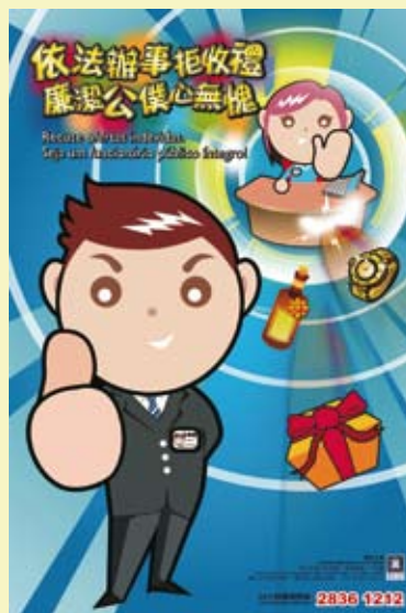
Poster of “Act in accordance with Law. Do not Accept Advantage.”