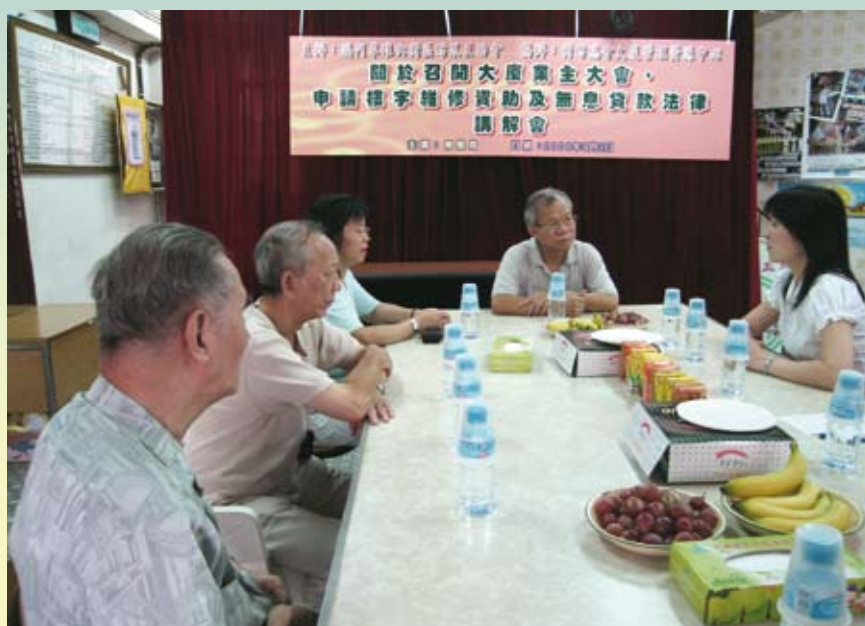
The CCAC's representatives met the leadership of civil associations and exchanged opinions with them

organized seminars for the associations and participated in activities held by them in order to jointly promote integrity awareness. Moreover, the Branch Office at Taipa is expected to start operating in mid-2009 in order to further the CCAC's community activities.