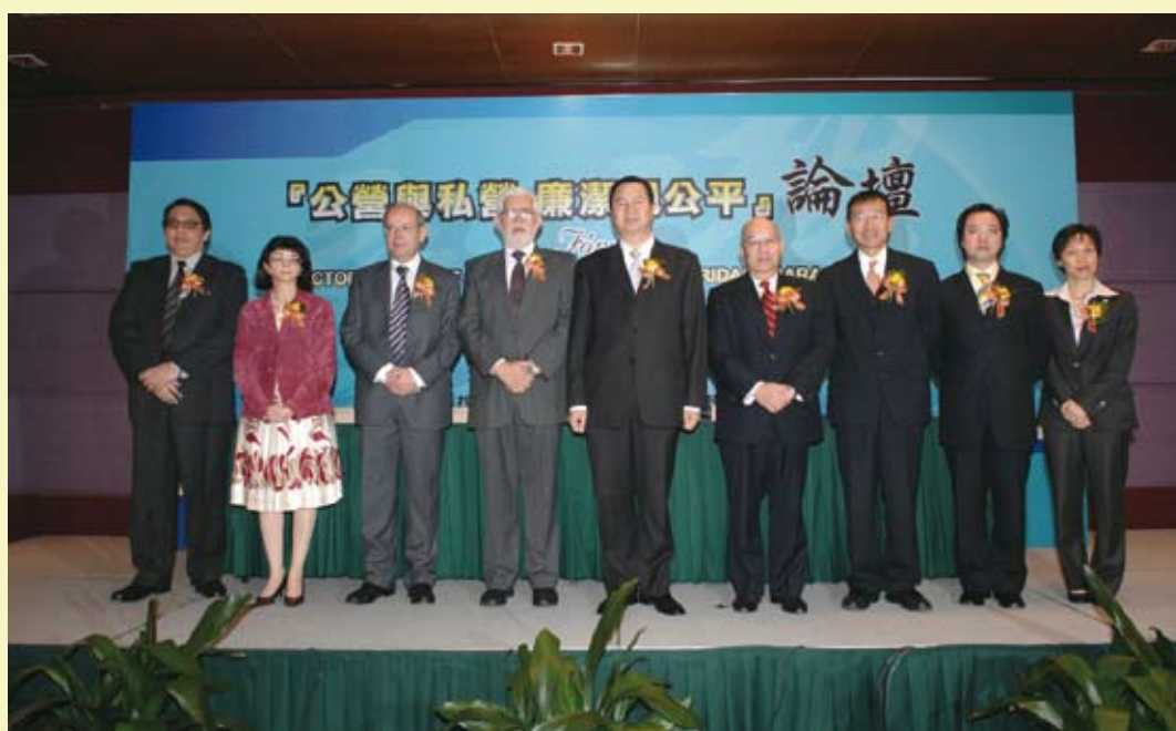
The Commissioner, Cheong U, and guest speakers

In early March 2008, the CCAC organized 2 sessions of forum entitled "Private and Public Sector: Towards Integrity and Fairness". Experts and scholars from Macao, Hong Kong and Portugal were invited to give speech, while there were over 700 participants, including members of the Executive Council and the Legislative Assembly, judges and public prosecutors, senior management and public servants at different levels of public departments and institutions, representatives of community associations, employers of private companies and representatives from different strata of the society, who were active in posing questions, exchanging views and discussing with the guest speakers.