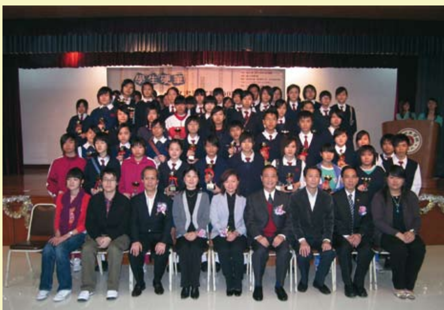
The representatives of the CCAC and the General Association of Chinese Students of Macau, guests and winners of Honesty and Integrity: the 9 th Chinese Calligraphy Contests for Macao Students