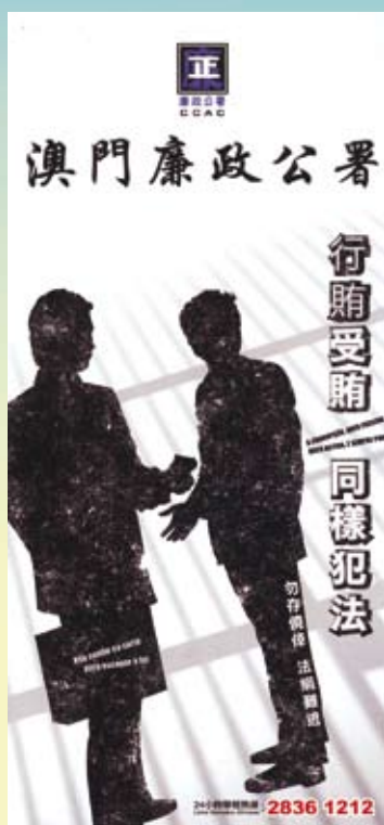
Anti-Corruption leaflet entitled "Both Giving and Taking Bribe are Offences"