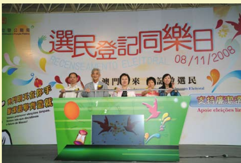
The guests officiated the inauguration ceremony

The 4 th Legislative Assembly Election is going to take place in 2009. Highly concerned about the integrity and impartiality of election, the CCAC has established the Task Force to Fight Against Electoral Corruption to conduct the works on prevention and promotion. In November 2008, the Commission co-organized the “Happy Day of Voters Registration” twice with the Public Administration and Civil Service Bureau (SAFP), aiming to promote voters registration and the message of electoral integrity in the public. Based on the experiences in the supervision on the Legislative Assembly Election 2005, the education on “clean election” has become part of regular promotional activities and was added into the activity for primary 5 students of the New Generation of Integrity—an Education Programme on Honesty for Primary Students” and the “Education Programme on Honesty for Secondary Students.” In 2008, the CCAC had been actively liaising with local secondary schools to co-organize seminars on “clean election” or “Act on Integrity” in order to enhance teenagers’ awareness of electoral integrity. The Guidelines for Voters Registration have been published based on the newly revised voters registration law and were distributed to public departments, schools, civil associations and private entities for free. With the co-operation of the SAFP, the copies are available at the voters registration stations at different districts in order to educate the newly registered voters.