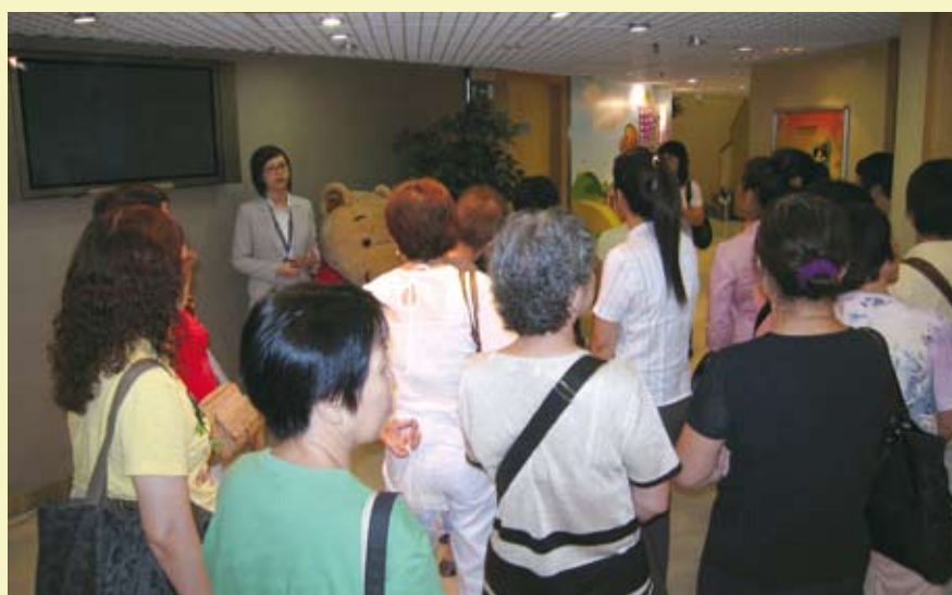
Members of the Women's General Association of Macau visited the CCAC's Branch Office at Areia Preta