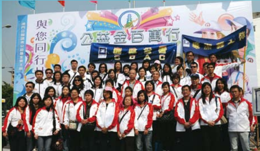
The Integrity Volunteer Team and the CCAC personnel participated in Charity Walk for Millions