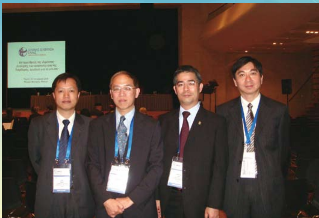
Deputy Commissioner, Afonso Chan, led a delegation to the 13 th International Anti-Corruption Conference in Athens