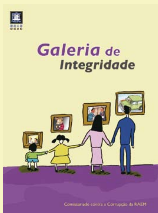
Portuguese version of Integrity Story Salon