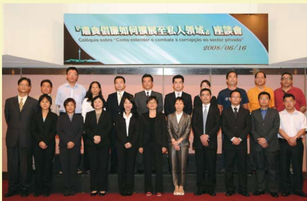
Representatives of public servants' associations