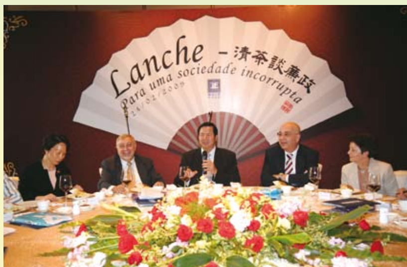
The annual “Tea Meeting on Clean Administration” between the CCAC’s leadership and media directors

Maintaining close connection and good partnership with the media facilitates the communication and cooperation between the CCAC and different sectors. The CCAC organized the “Tea Meeting on Clean Administration” each year in order to obtain opinions and suggestions about anti-corruption work from media workers. The Commission also held press conferences to release the information about anti-corruption work to the media in order to enhance the transparency.