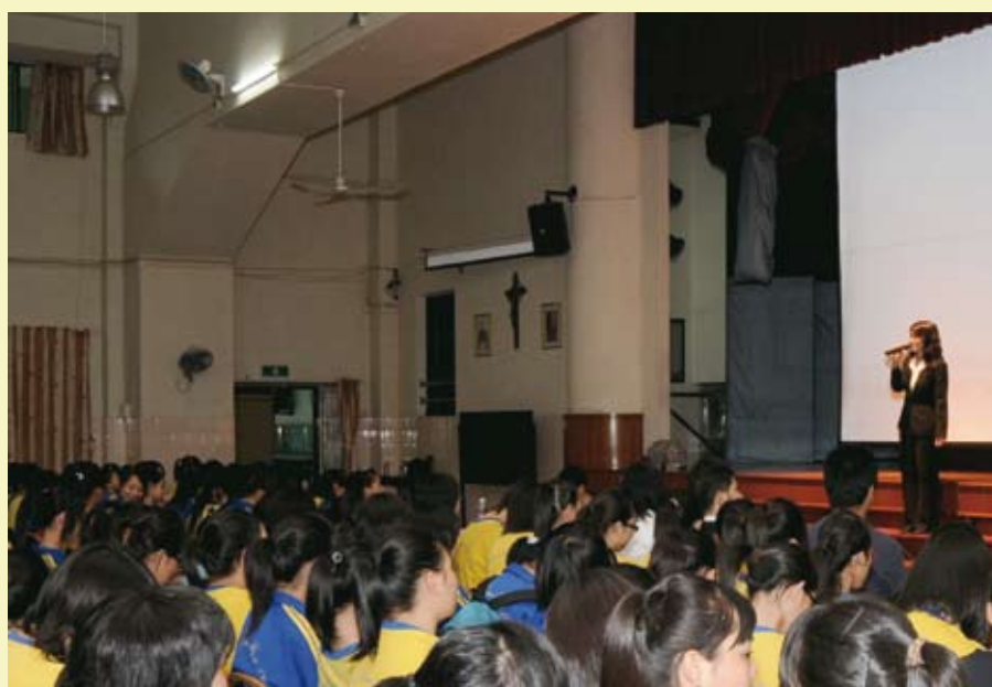
Chief of Cabinet of the Commissioner, Ho Ioc San, delivered speech during the inauguration ceremony of “Integrity Week” at Our Lady of Fatima Girl’s School