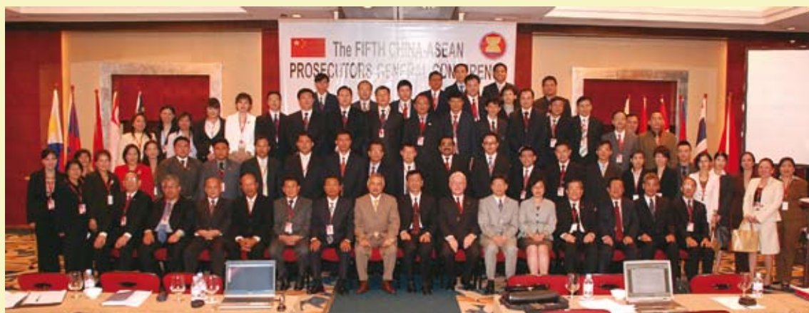
Attendants of the 5 th China-ASEAN Prosecutors General Conference