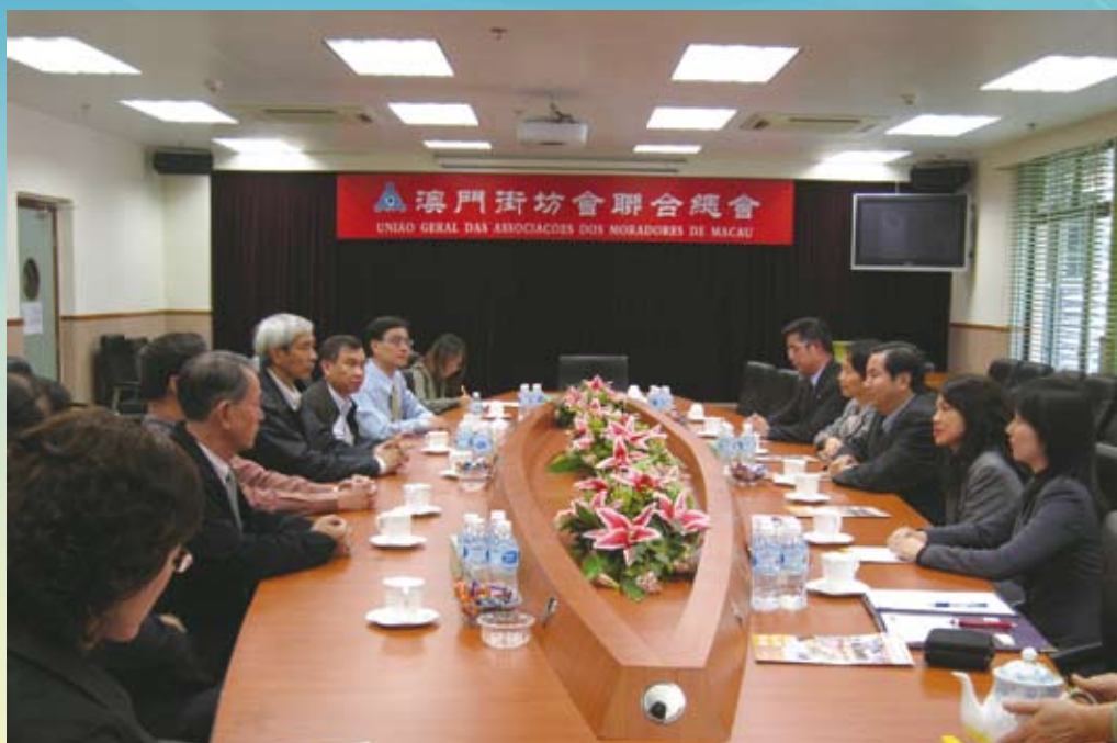
The CCAC's leadership met with representatives of the General Union of Neighbourhood Associations of Macao