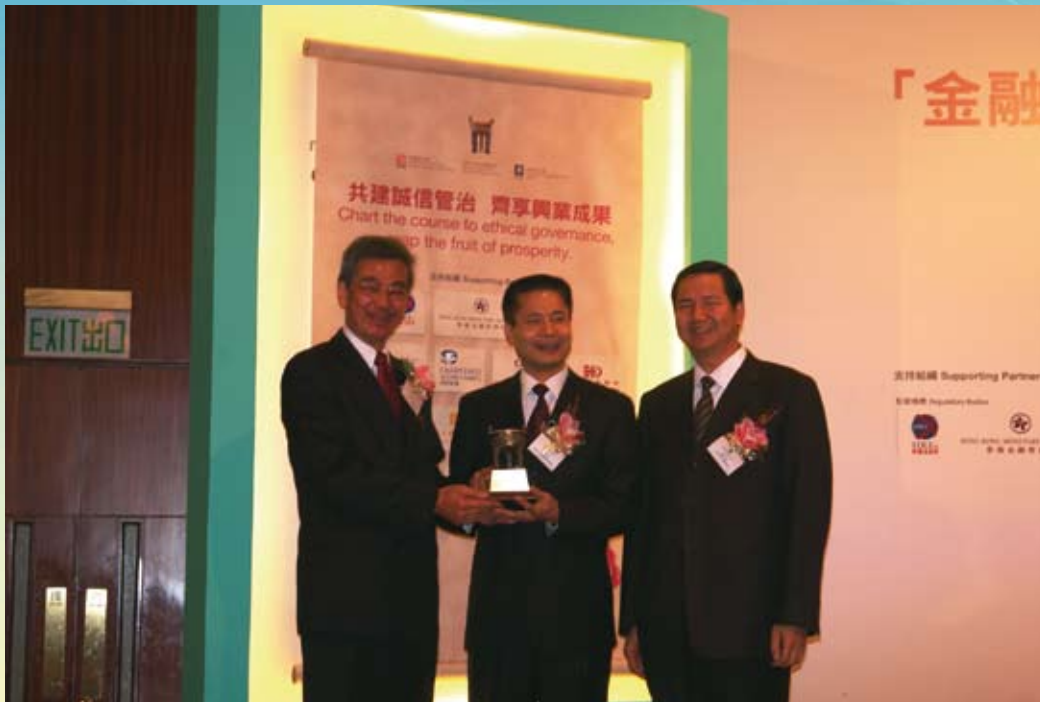
Vice Minister of Supervision, People's Republic of China, Yao Zengke ( middle ), Commissioner of ICAC, Timothy Tong ( left ), and Commissioner of CCAC, Cheong U at the opening ceremony of the Conference on Corporate Governance in the Financial Sector