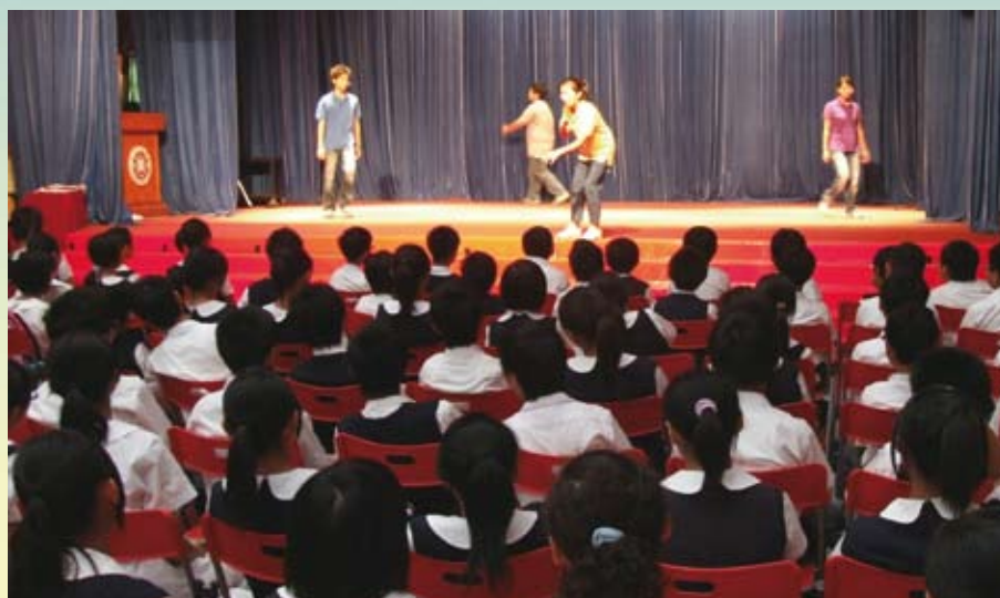
Introducing awareness of integrity and law-abidingness to secondary students through drama

the CCAC also co-organized “Integrity and Honesty: the 9 th Chinese Calligraphy Contests for Macao Students” with the General Association of Chinese Students of Macau and participated in the “Carnival against Crime and Drug Abuse” organized by Junior Police Call.