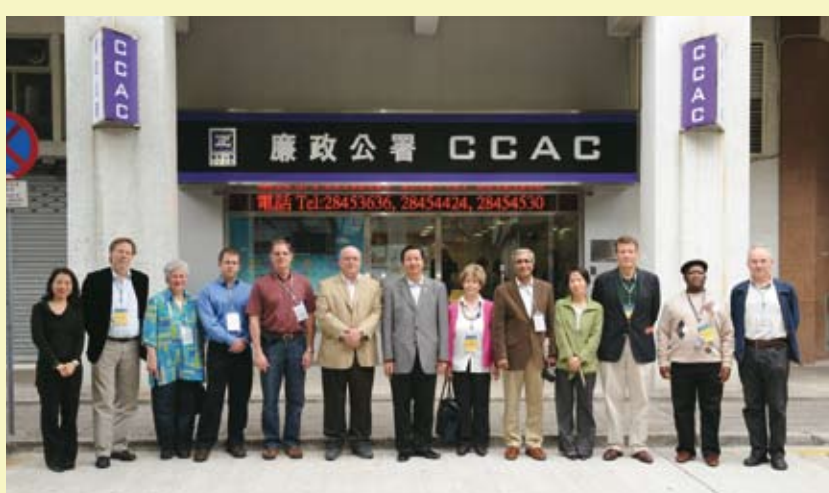
Members of the Board of Directors of the IOI visited the Branch Office at Areia Preta