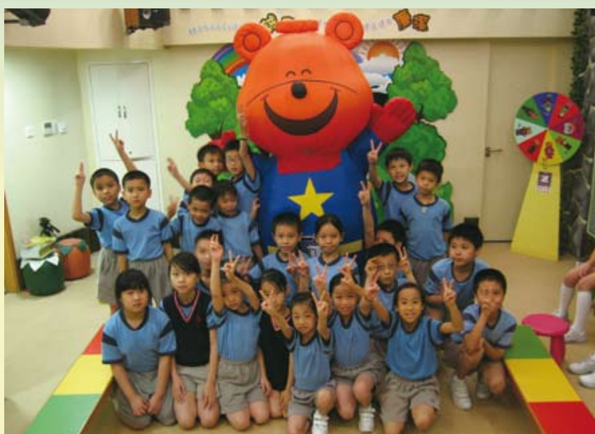
Primary students participated in “New Generation of Integrity” series

In 2008, the CCAC continued to organize a series of activities entitled “New Generation of Integrity—an Education Programme on Honesty for Primary Students” for students in primary 4 to 6 at the activity room named “Paradise of Integrity” at the CCAC’s Branch Office at Areia Preta. A total of 5,812 students from 30 primary schools participated in 157 activities throughout the year.