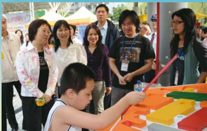
Accompanied by the leadership of the CCAC, Secretary for Administration and Justice visited the CCAC's booth