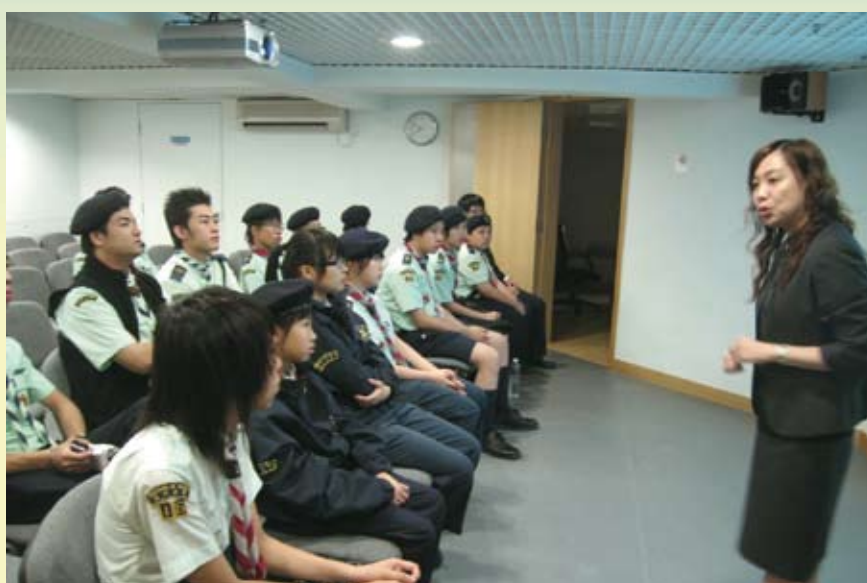
Seminar organized for the Scout Association of Macau, aiming to promote integrity among scouts

In 2008, there were a total of 8 seminars and visits organized for members of community associations which attracted 277 participants. For the staff of private entities, 19 seminars were organized with a total of 635 participants. The CCAC will carry out the promotions for community associations and private entities in various ways, focusing on different topics for different targets in order to achieve the best effect.