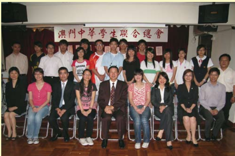
The Commissioner, Cheong U, led the CCAC's representatives to visit the General Association of Chinese Students of Macau