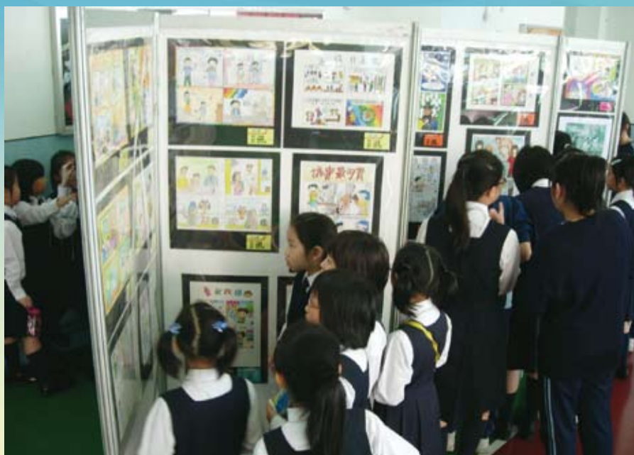
The exhibition of awarded works of the comic drawing contest attracted many students