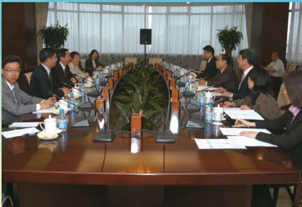
The CCAC's delegation was invited to have a work meeting with the Ministry of Supervision of China in Beijing