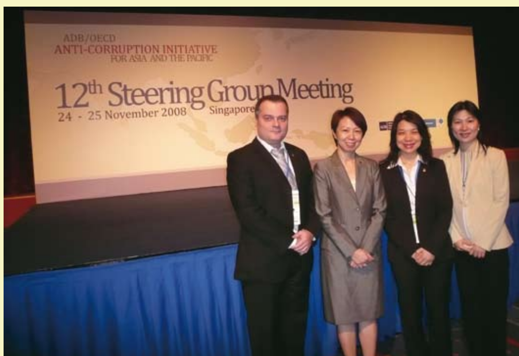
Delegation at the 12 th Steering Group Meeting of ADB / OECD Anti-Corruption Initiative for Asia and the Pacific