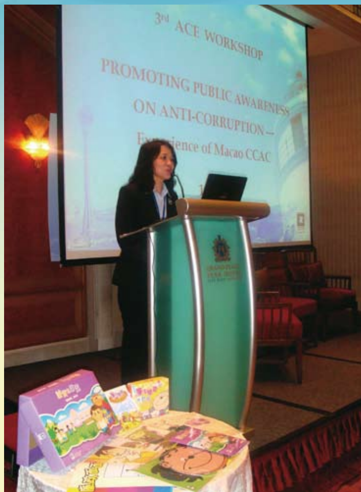
Chief of Cabinet of the Commissioner, Ho Ioc San, was invited to deliver a speech at the Anti-Corruption Expertise Workshop in Singapore