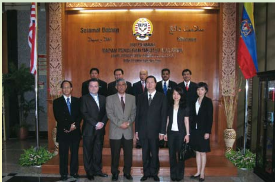
The CCAC's delegation and the leadership of the Anti-Corruption Agency of Malaysia

Ukraine, the Board of Directors' Meeting of the International Ombudsman Institute (IOI) in Hong Kong, the Anti-Corruption Expertise Workshop in Singapore at which the promotional and education works of the CCAC were introduced, the 13 th International Anti-Corruption Conference in Athens, the 5 th China-ASEAN Prosecutors General Conference in Manila, the 12 th Steering Group Meeting of ADB / OECD Anti-Corruption Initiative for Asia and the Pacific and Regional Conference in Singapore and the Symposium of Brazilian Ombudsmen.