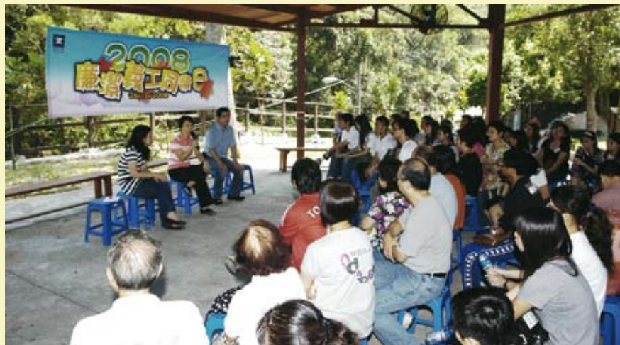
Volunteers and the leadership of the CCAC shared opinions at the Integrity Volunteers' Day 2008

Moreover, in order to enhance the participation of members and the spirit of teamwork, the CCAC organized the Integrity Volunteers' Day 2008 in late October. Deputy Commissioner, Tou Wai Fong, and Chief of the Cabinet, Ho loc San, also participated in the activity and met with the volunteers to exchange views on the integrity building in Macao.