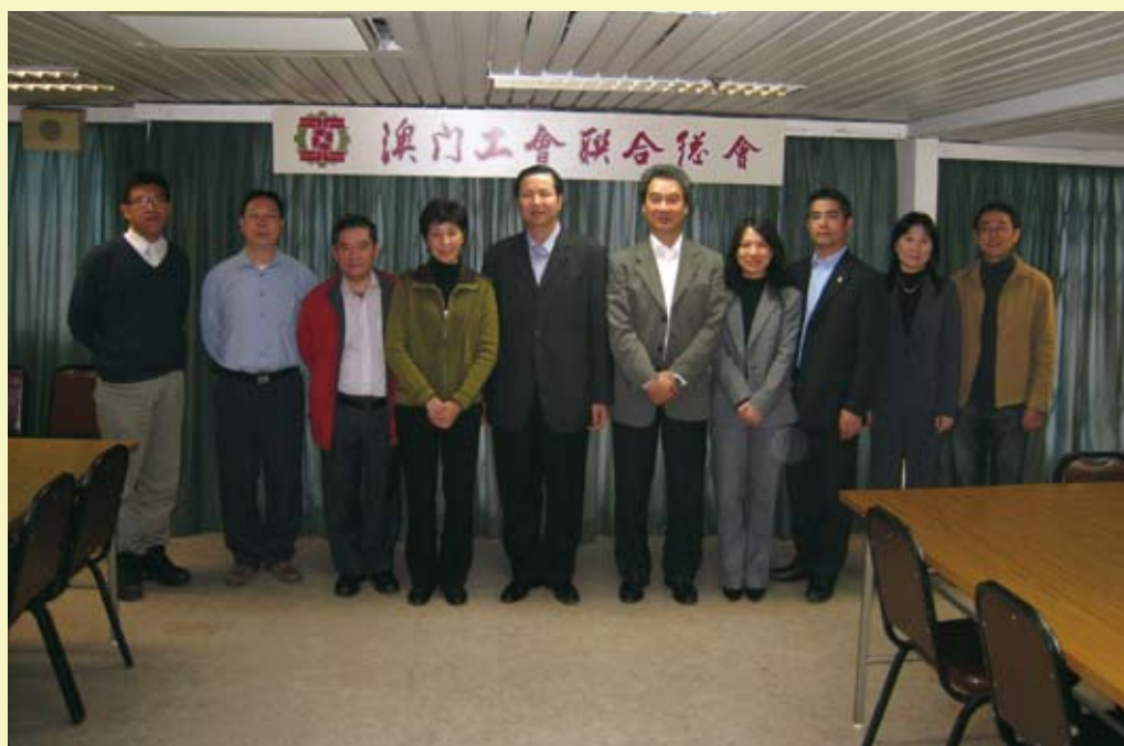
The CCAC's leadership visited the Macao Federation of Trade Unions