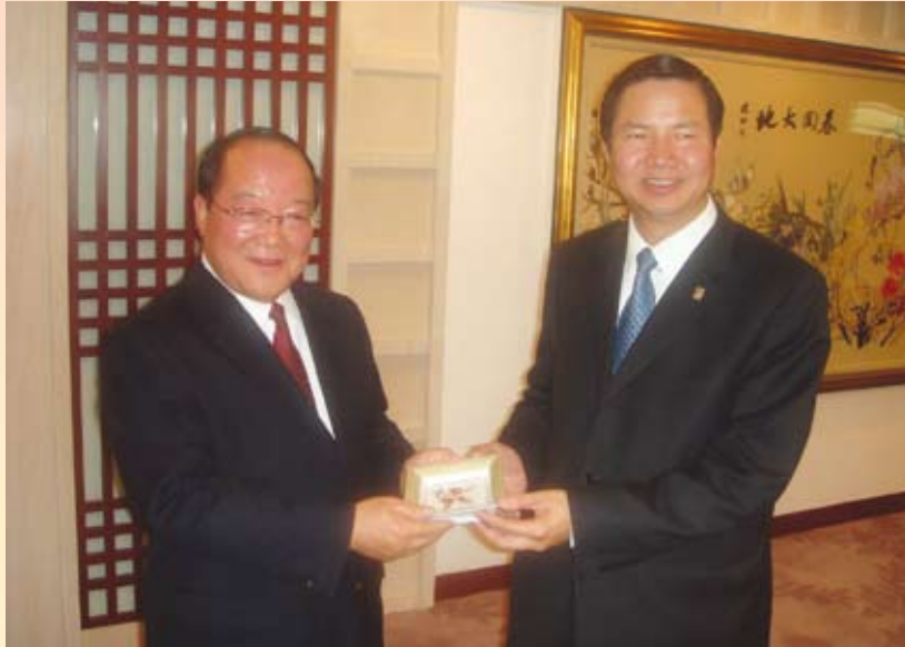
The CCAC delegation was invited by Supreme People's Procuratorate of the People's Republic of China to visit Beijing. The Commissioner Cheong U presented souvenir to Vice Procurator General Zhang Geng

of Directors; an inspection tour of the Ministry of Supervision in Beijing and the Department of Supervision in Hangzhou led by the Deputy Commissioner Endy Tou.