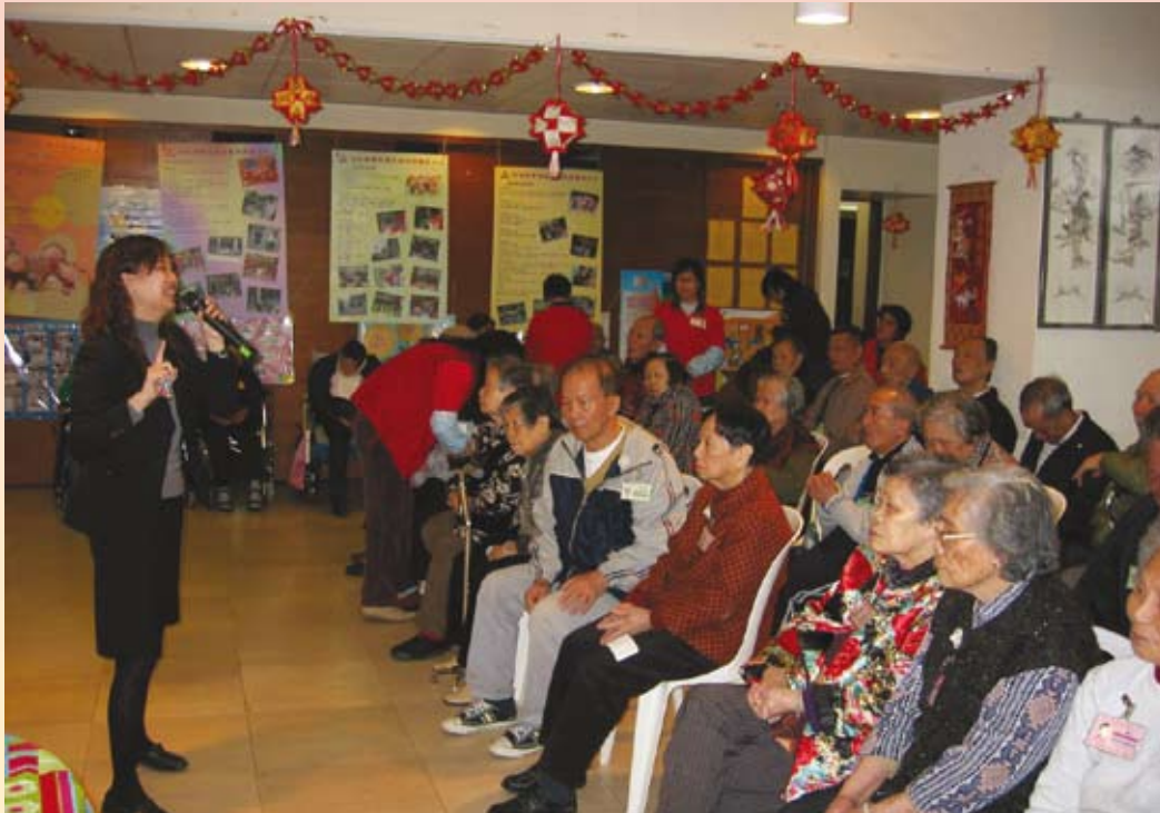
Extending the message of integrity to the elderly