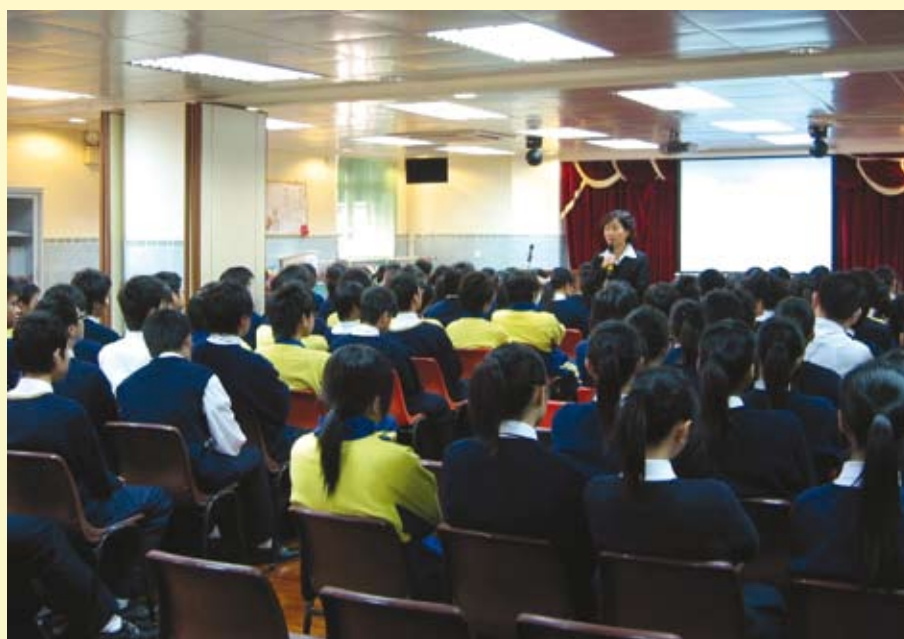
Secondary students attend seminars on integrity education

In addition to “Integrity Week”, seminars on integrity education targeting teenagers took place on an on-going basis. As well as an introduction to anti-corruption works, the seminars thoroughly explored the concepts of money and fairness to further raise the teenagers’ consciousness of integrity. Some 19 seminars attracted 6,472 participants in 2007.