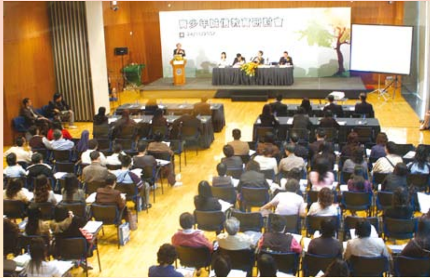
Local educational workers, delegates from government departments and youth associations attended the symposium