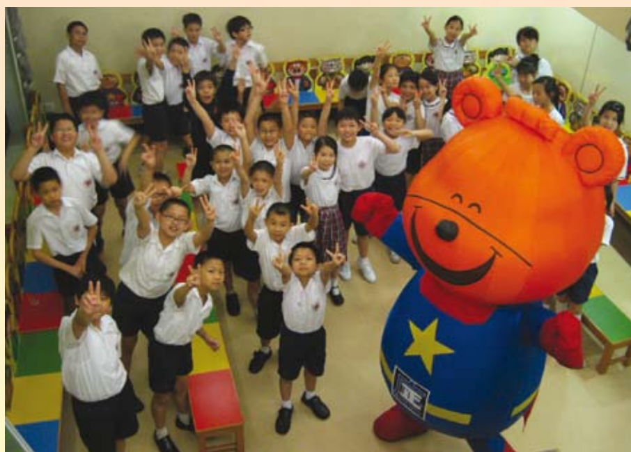
Children and William celebrated Children's Day

The CCAC organised 18 activities before and after Children's Day on 1 st June, as they had in 2006, in order to celebrate Children's Day with 671 primary students from different schools. In addition, the CCAC co-organised a bazaar with several government departments at Macau Forum and an activity entitled "Celebration of June 1 st Children's Day" with the General Workers' Union of Macao. The activity instilled in the children an awareness and value of integrity and observance through special games.