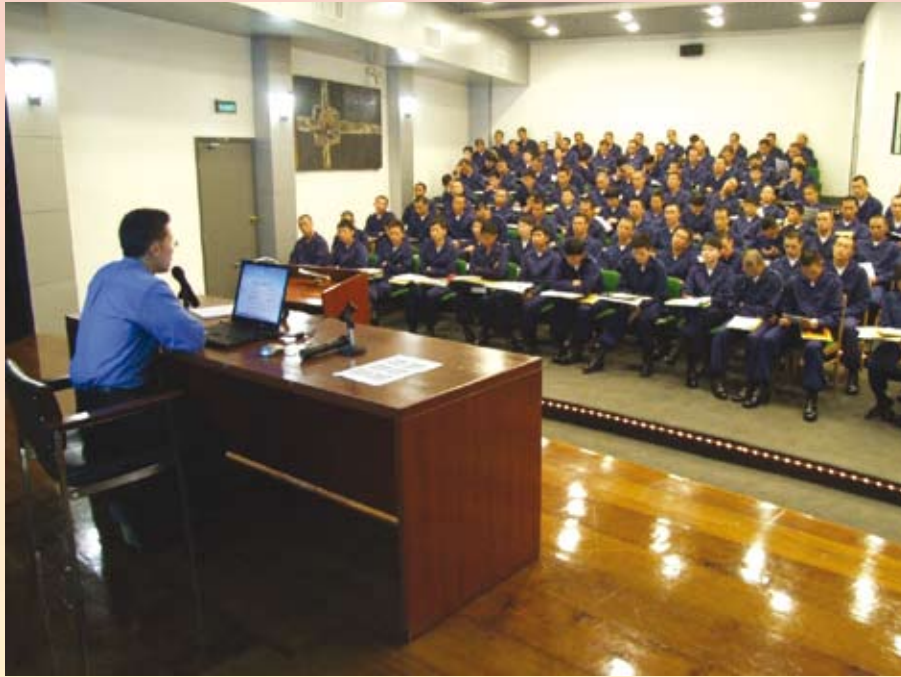
Integrity Seminars for trainees of Public Security Forces