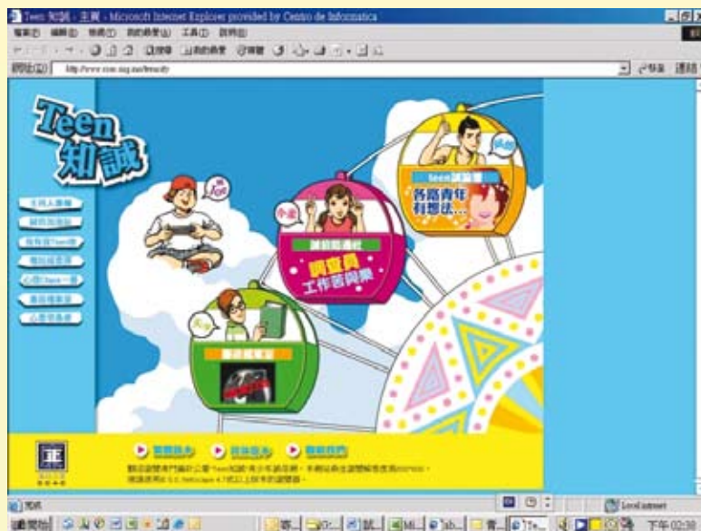
The CCAC's "Teen City" Website

In order to cultivate teenagers' consciousness of honesty and observance, the CCAC created "Teen City" ( www.ccac.org.mo/teencity ), a website promoting integrity among teenagers which was launched in September 2007. "Teen City" serves as a platform for the CCAC to interact with youngsters so that they have a greater opportunity to actively participate in integrity education programmes. Also, the CCAC co-operated with a number of local secondary schools to link the website to the schools to reinforce the effect of the campaign.