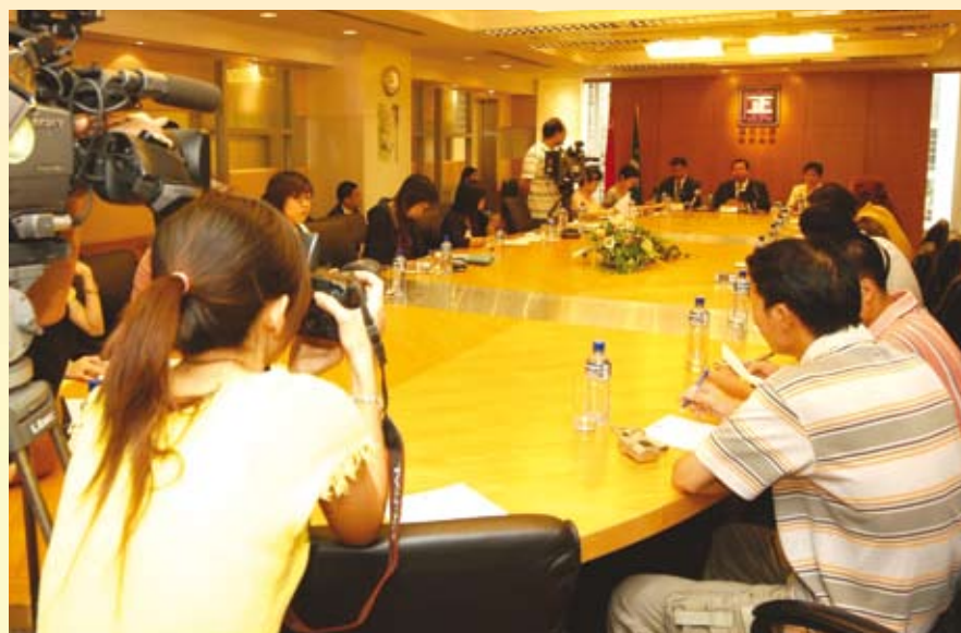
The CCAC leaders host press conference