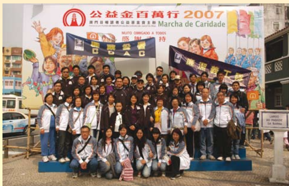
Integrity Volunteer Team and the CCAC personnel participate in "Charity Walk for Millions"