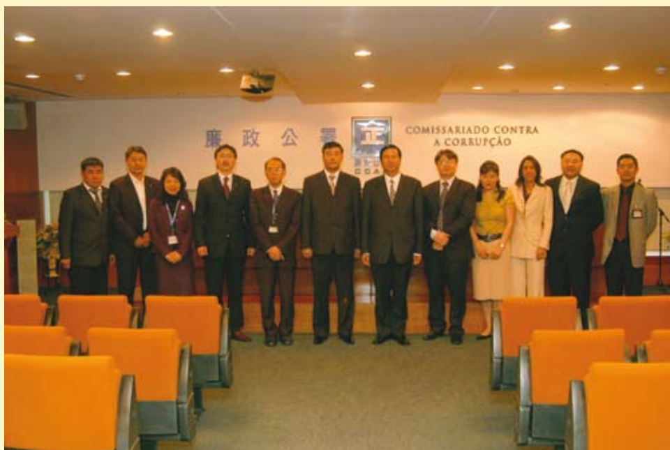
Delegation from Anti-corruption Authority of Mongolia visited Macao