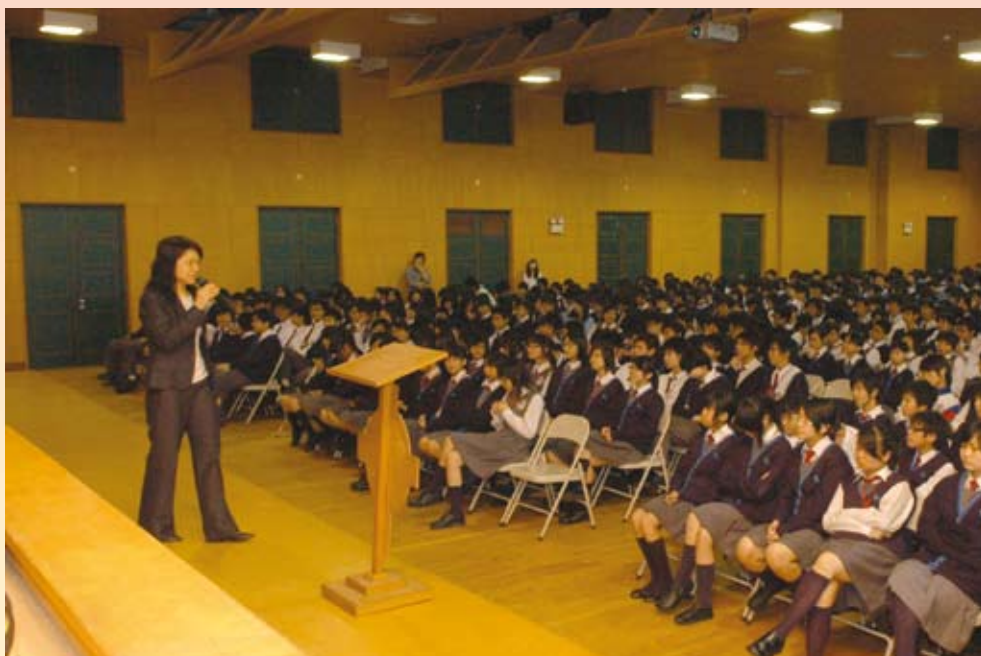
The CCAC Chief of Cabinet Ho Ioc San delivered speech during inauguration ceremony of “Integrity Week” at Macao Baptist College