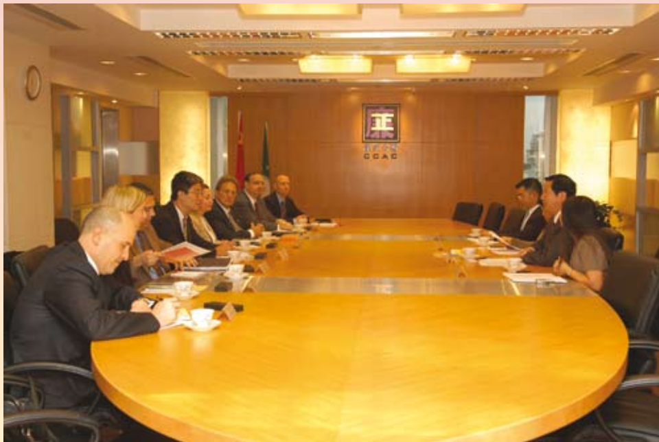
Delegation from US Government visited Macao