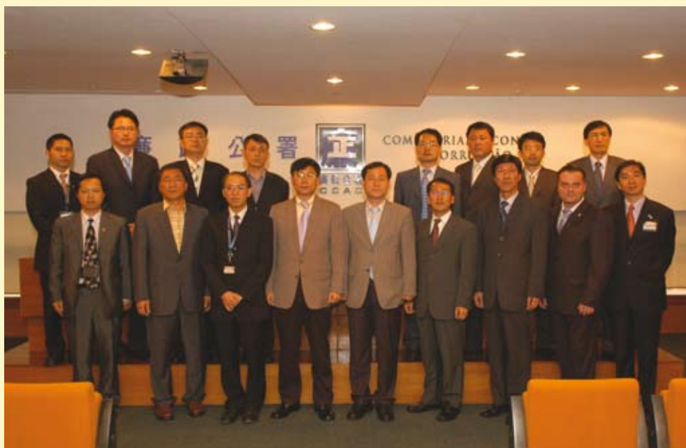
Delegation from Anti-corruption Bureau of South Korea visited Macao