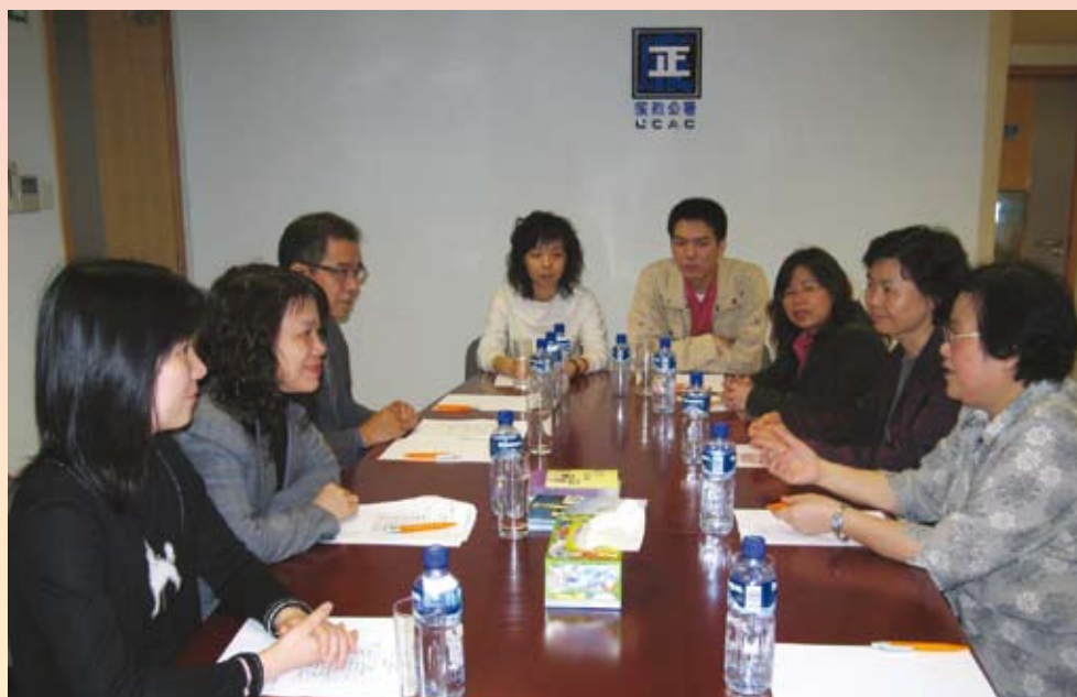
The CCAC leadership shared opinion with civil associations

In addition, the branch office of the CCAC frequently organised seminars for community associations on the topics of “Integrity Awareness” and “Education on Honesty for Teenagers”. It also participated in activities organized by community associations, thus strengthening community propaganda and working together to promote integrity education in the community. In order to encourage more citizens to familiarize themselves with the services of the branch office, the CCAC made use of posters, buses, newspapers and radio advertisements. The location of the branch office on the islands has been selected and confirmed, and is expected in operation at later time.