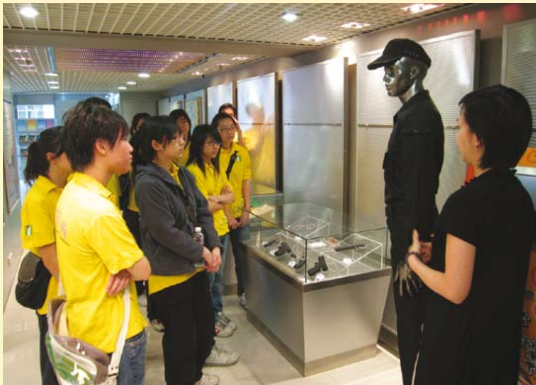
"Good Citizen Family" volunteer squads of the Municipal Affairs Bureau visited the CCAC branch office