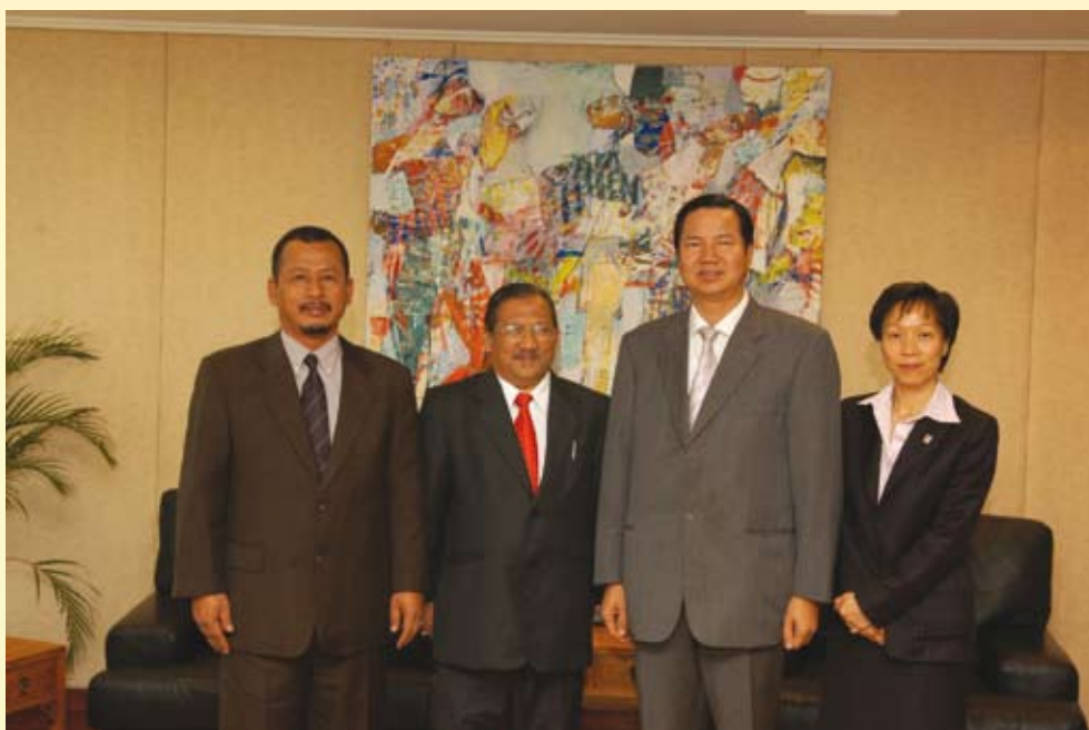
Delegation from Public Complaints Bureau of Malaysia visited Macao