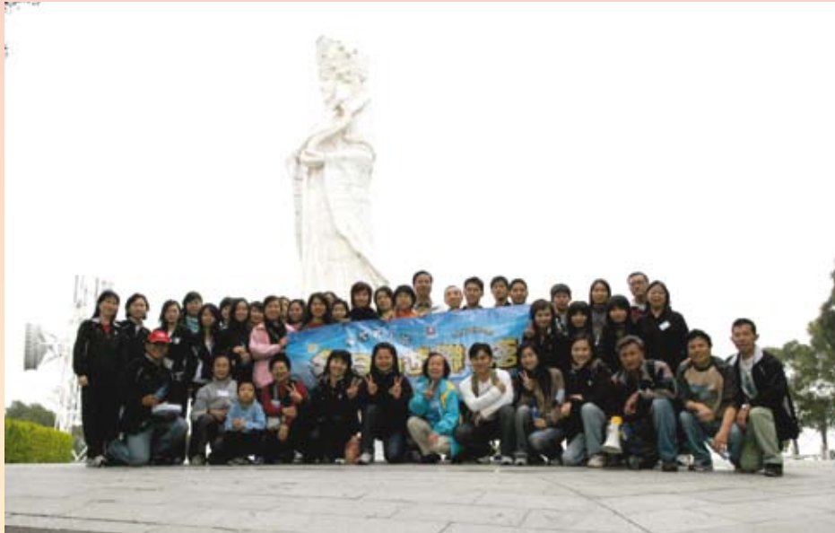
Volunteers and the CCAC leadership gathered at outing