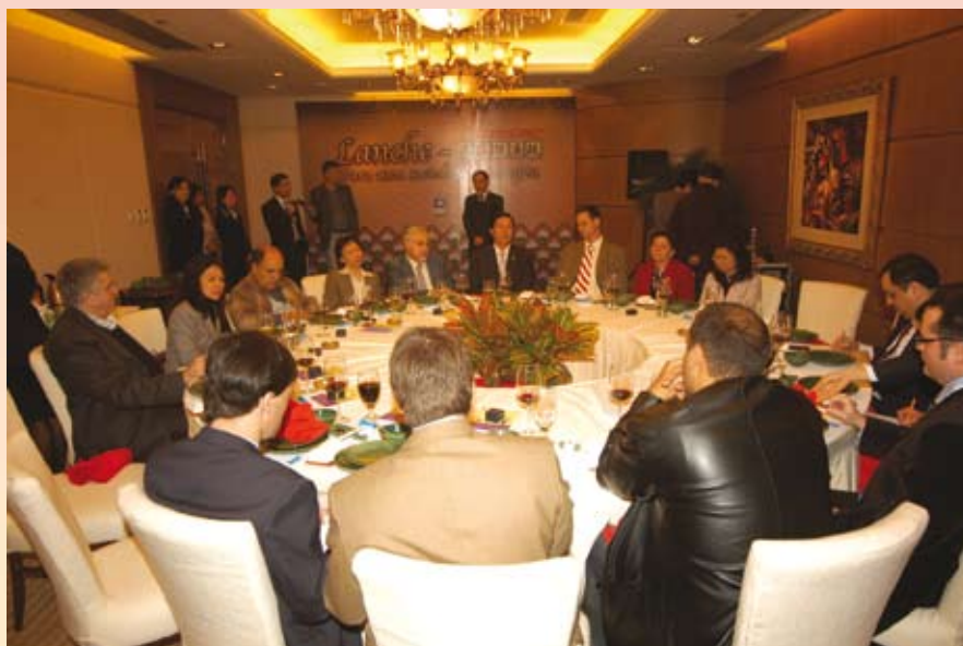
The CCAC and media directors at annual "Tea Meeting on Clean Administration"