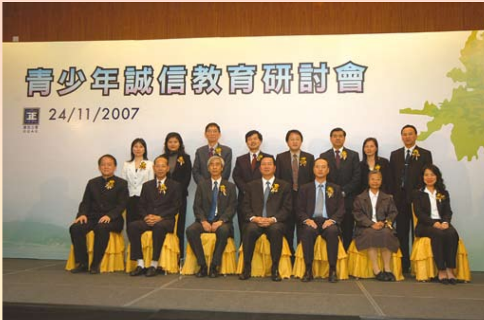
Guests of honour and speakers