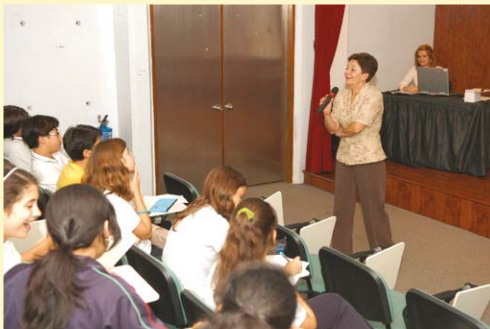
The CCAC co-organized “Integrity Week” with Portuguese School of Macao