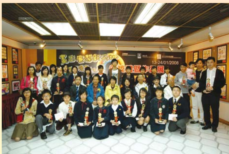
The CCAC leadership, guests and winners at “Draw a New World of Integrity” comic drawing contest

In 2007, the CCAC organised or co-organized in a number of activities for teenagers, including co-organising “Draw a New World of Integrity” comic drawing contest and “Honesty and Integrity: Chinese Calligraphy Contest for Macao Students” in conjunction with the Chong Wa Student Association of Macao, and also participated in the “Carnival against Crime and Drug Abuse” organised by Junior Police Call.