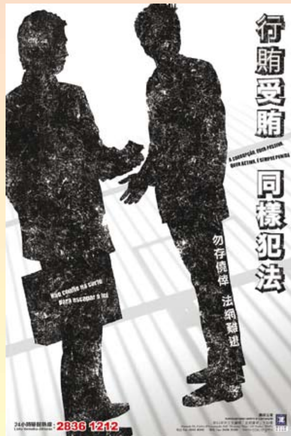
Anti-corruption poster - “offering or receiving bribes constitutes a crime”

-Created a new anti-corruption poster - “Don’t Take Chances!” - with the objective of reminding residents that “offering or receiving bribes constitutes a crime”; strengthened the advertising impact by distributing posters to government departments, community associations and schools, etc.