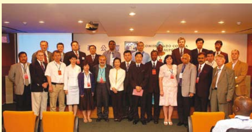
Delegates from different countries attending the IAACA Seminar organised by Supreme People's Procuratorate of the People's Republic of China. Delegation heads posed for photos with the CCAC leadership