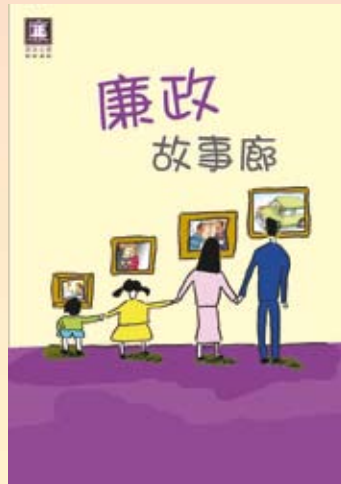
Integrity Story Salon comic book

- Publish the book Integrity Story Salon , with the objective of promoting citizens' awareness of integrity in a light-hearted manner to attract the attention of citizens; in particular, teenagers with comics illustrating the theme of integrity, fighting corruption and abiding by the law, etc;