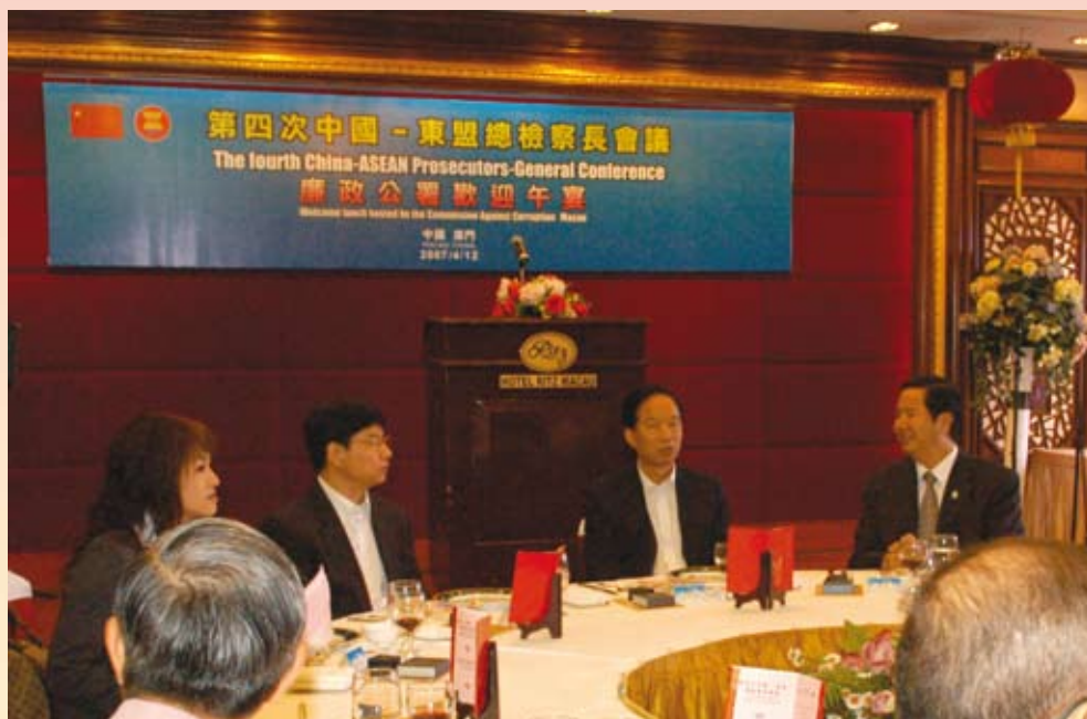
The 4 th China-ASEAN Prosecutors-General Conference was held in Macao in April. The Commissioner took part in the Conference and invited all delegations for luncheon. The Commissioner had a pleasant conversation with Jia Chunwang, Procurator-General of the Supreme People's Procuratorate during the lunch