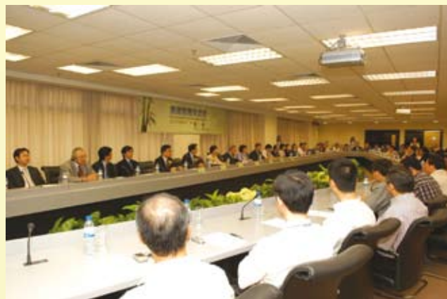
Integrity Management Symposiums