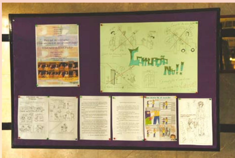
Anti-corruption promotion works created by students from Portuguese School of Macao

In addition to “Integrity Week”, seminars on integrity education targeting teenagers took place on an on-going basis. As well as an introduction to anti-corruption works, the seminars thoroughly explored the concepts of money and fairness to further raise the teenagers’ consciousness of integrity. Some 19 seminars attracted 6,472 participants in 2007.