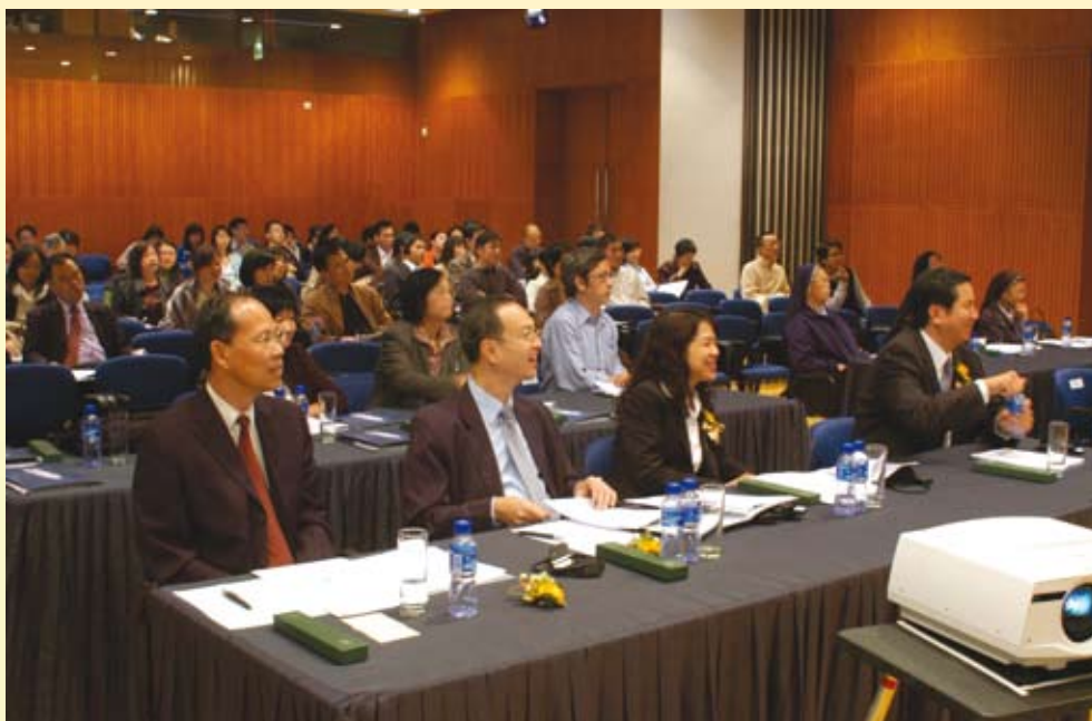
Attendees listened attentively to speakers