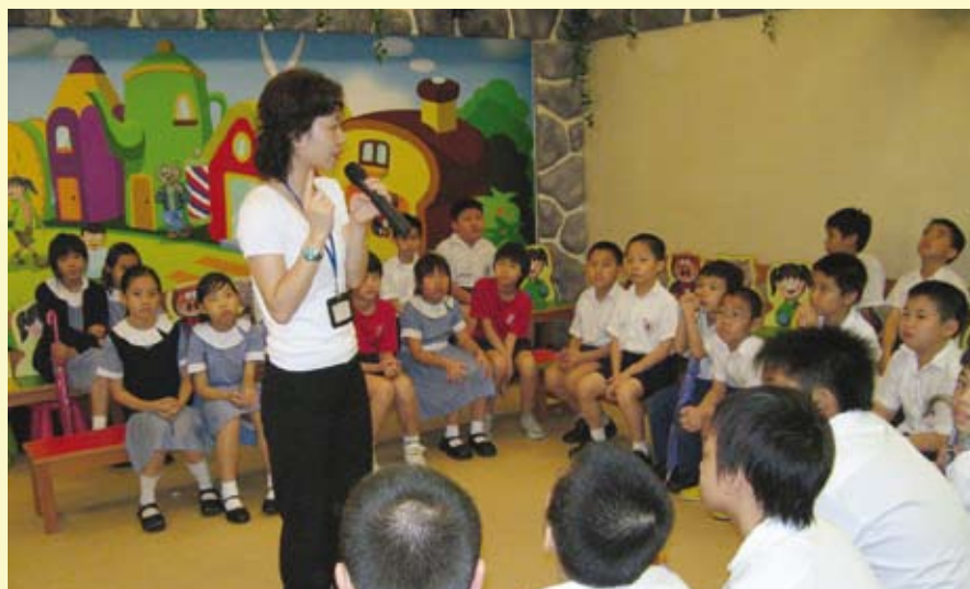
Primary students participated in “New Generation of Integrity” series

In 2007, the CCAC continued to organise a series of activities entitled “New Generation of Integrity – an Education Programme on Honesty for Primary Students” in the activity room named “Paradise of Integrity” at the CCAC’s branch office. The 125 activities promoted honesty and integrity via puppet shows, computer animation and short films. Some 5,234 primary students from 21 schools participated in the activities.