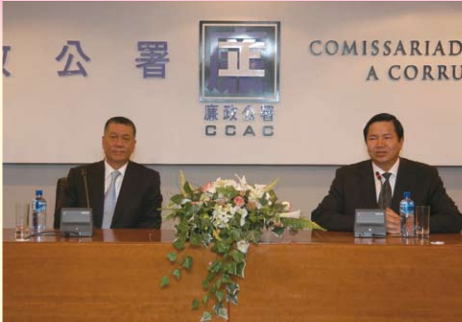
The Chief Executive Edmund Ho visited the CCAC on 6th December 2005