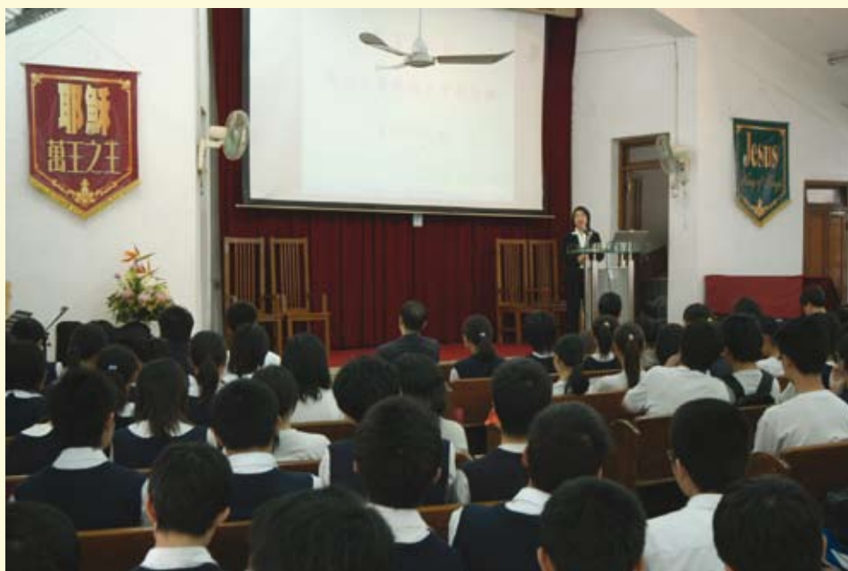
Inauguration ceremony of “The Integrity Week” in Pui Cheng Middle School

In order to further implement the “Education Programme on Honesty for Teenagers”, the CCAC took several schools as experimental units, carrying out “The Integrity Week” scheme. A multidimensional and interactive approach was adopted to promote integrity awareness and noble character for high school students.