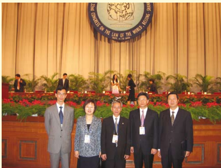
The Commissioner attended the 22 nd Congress on the Law of the World in Beijing