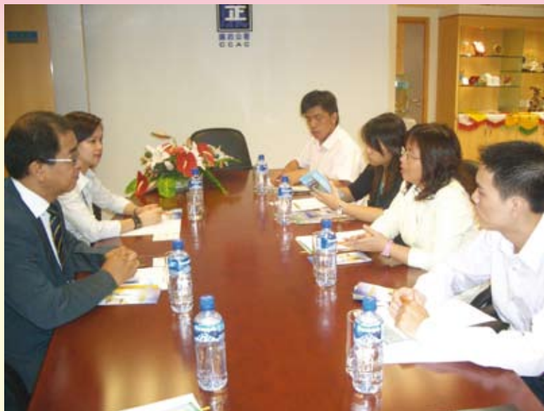
Association leaders visiting the branch office conversed with the CCAC representatives