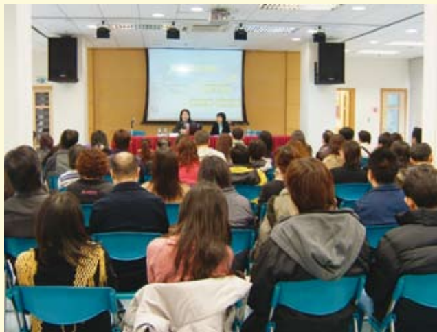
Seminars held for public servants

Since July 2001, the CCAC assisted the Public Administration and Civil Service Bureau in integrating the seminars of “Honesty and Integrity in the Interests of the Public” with its “Basic Training Course for Public Servants”. In 2005, there were 30 sessions held by the CCAC including 18 in Cantonese and 12 in Portuguese with 880 participants.