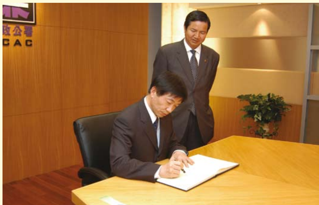
Vice-Minister of the Ministry of Supervision of China, Huang Shuxian visiting the CCAC and signing the "Beadroll of Honorable Guests"