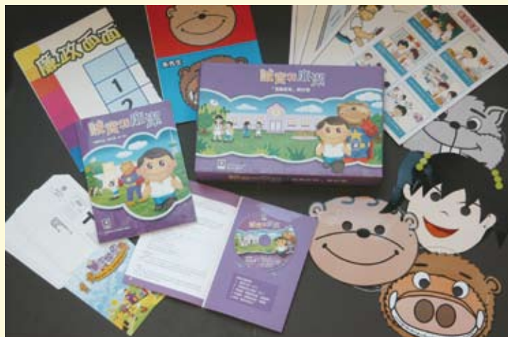
Revised teaching set for primary schools

As early as in 2003, the CCAC produced a textbook named Honesty and Integrity as a supplementary moral education teaching material for year 4 to year 6 primary school students, which has been adopted by 90% of primary schools in Macao. In 2005, based on the two years' teaching practice and suggestions received from the schools and teachers, the CCAC revised the book in the same year. Meanwhile, the CCAC compiled a complementing teaching book for teachers to achieve better results. The revised Honesty and Integrity has been distributed to 40 schools for free since August 2005.