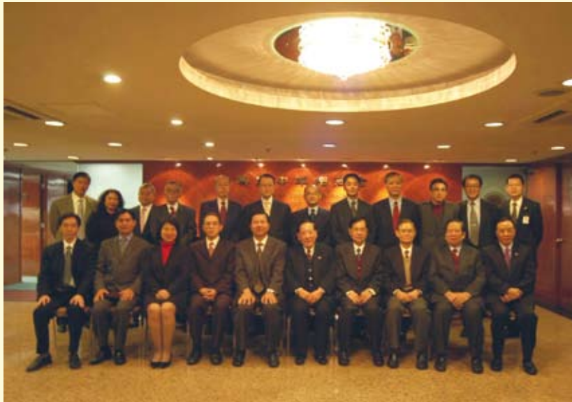
The Commissioner visited Macao Chamber of Commerce and met its leaders

of Macao Construction Industry, Association of Mutual Assistance of Hawkers of Macao, Association of Mutual Help for Fishermen, Women Association of Taipa and Coloane, Friendship Association of Coloane Residents, Macao Association of Office Staff and so on. From these meetings, the CCAC collected opinions from all walks of life on anti-corruption work.