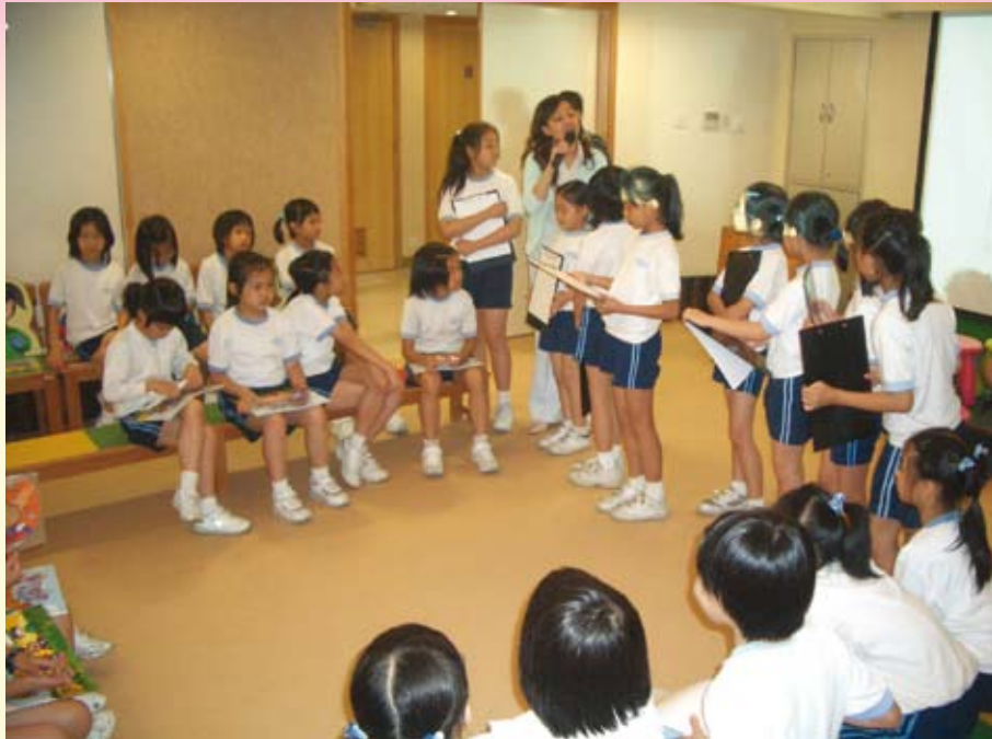
Primary students participating in activities of the “New Generation of Integrity” in the CCAC branch office

Representatives of the international organization “Transparency International”, who visited the CCAC and its branch office, highly regarded the Integrity-Education Programme, which was introduced in a special edition in December 2004 of the moral educational journal of the Transparency International – Teaching Integrity to Youth ; the first time Macao’s experience of youth integrity education was shown on an international stage.