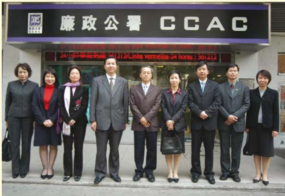
The leaders of the Civic and Municipal Affairs Bureau visited the CCAC branch office