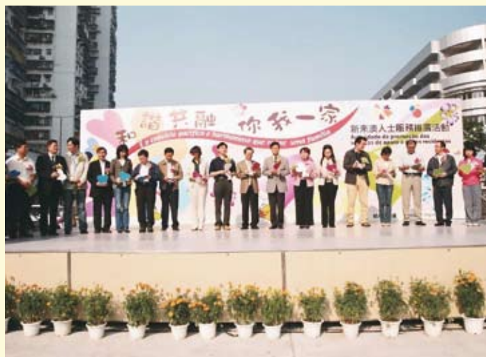
Participating in the activity of “Promoting Services for New Residents of Macao” organized by Social Welfare Bureau

- Activities like “Celebrating with Public Servants”, “June 1 st International Children’s Day”, “Carnival Against Crimes and Drug Abuse”, “Promoting Services for New Residents of Macao” organized by public servant associations, General Workers’ Union of Macao, Junior Police Call and Social Welfare Bureau respectively;