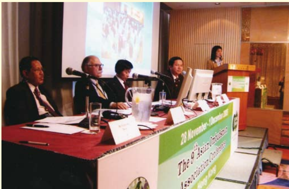
The CCAC participated in the 9 th Asian Ombudsman Association Conference