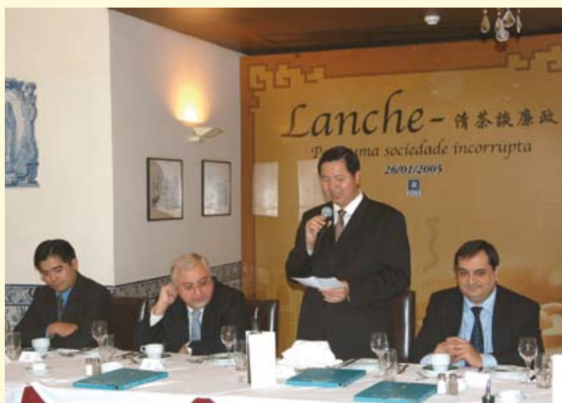
The CCAC meets media directors in the annual “Afternoon Tea Meeting on Clean Administration”

Maintaining close ties and good relations with the media has long been the CCAC’s basic principle, which benefits its communication with the society.