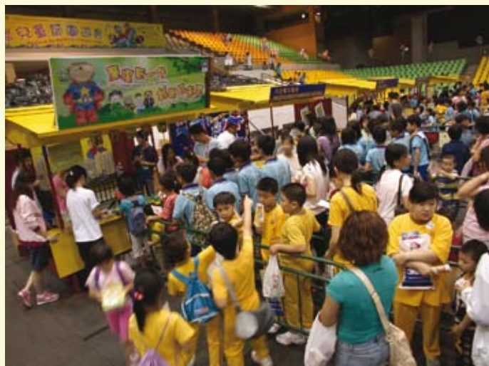
Participating in “Children’s Day” activity co-organized by several government departments