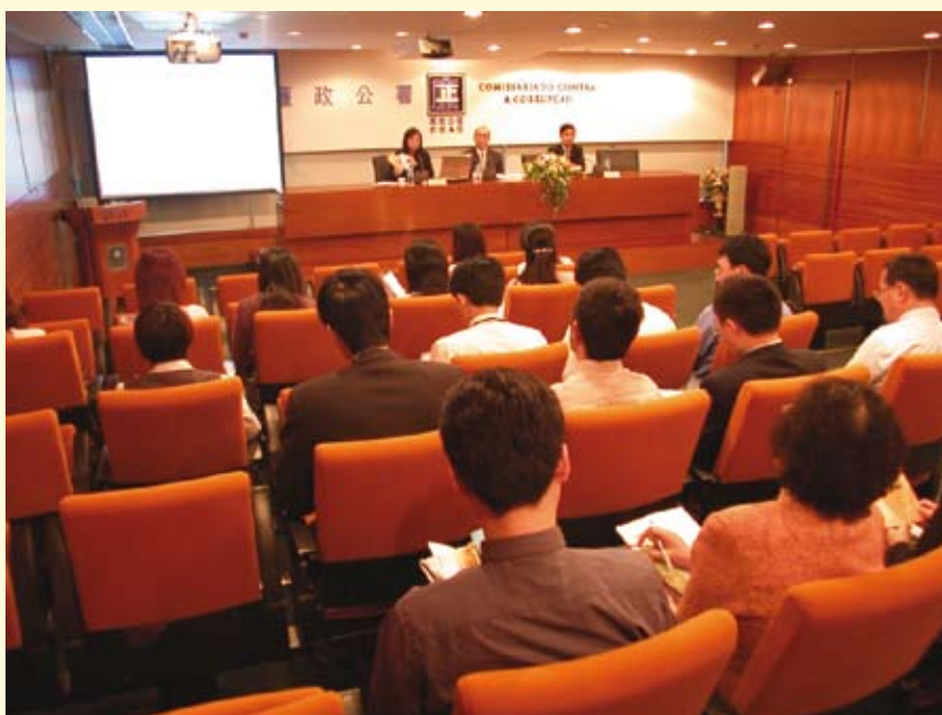
A seminar on “Integrity Awareness” was held for staff members of the Industrial and Commercial Bank of China , Macau branch

In 2005, 12 sessions of seminars and visits were organized for institution and civil association members, with 510 participants.