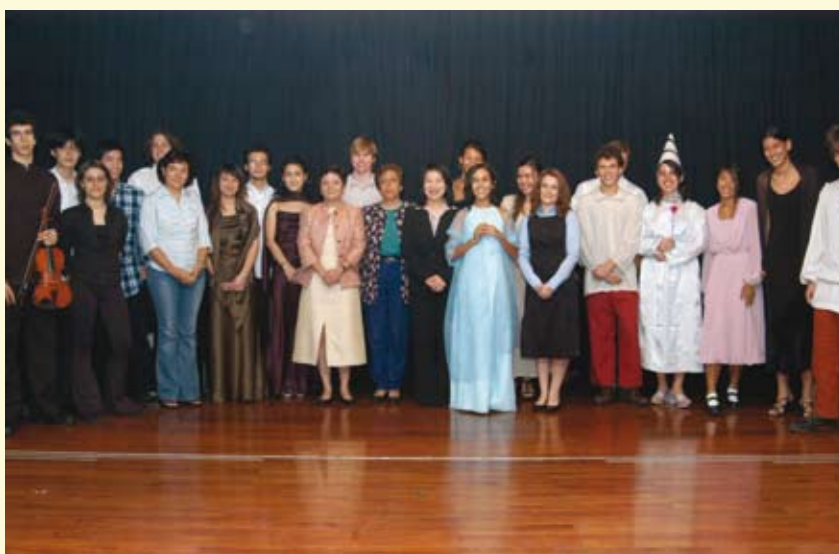
Representatives of the CCAC, the leaders of the Macao Portuguese school and students on stage for group photo

The activities of “The Integrity Week” were designed in a most suitable way to combine with the schools’ routine moral education, nurturing values and a spirit of righteousness and integrity through sharing experiences, visual materials, dramas, songs and other multimedia and interactive ways. The activities included exhibitions on the functions of the CCAC and the real cases it handled, paper-games, student-orientated talks by the CCAC staff as well as projections of short films adapted from real cases. In the meantime, the short drama of “Choice of Man” based on a real story directed and played by students themselves was performed on stage and the song of integrity sung. An adapted drama “Corrupt Cinderella”, written, directed and performed by students of the Macao Portuguese school, was also played.