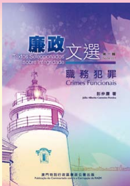
The Selected Work of Integrity(1) –Occupational Crimes