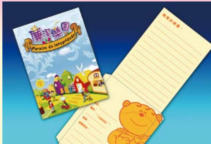
Primary school students can write letters to William of the CCAC by using the postage pack