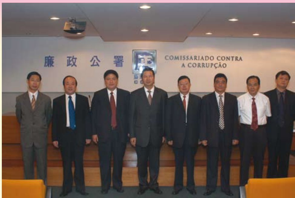
Delegation of the Supreme People's Procuratorate visiting the CCAC