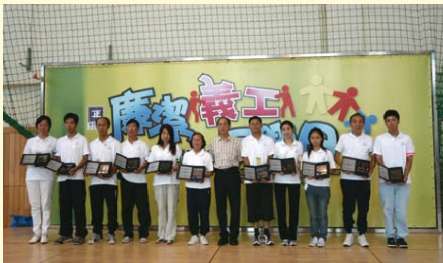
Outstanding members of the “CCAC Volunteer Team” were awarded by the CCAC

team assisted the CCAC mainly in promoting integrity awareness, and participated in a series of anti-electoral-corruption activities during the legislative election held in September.